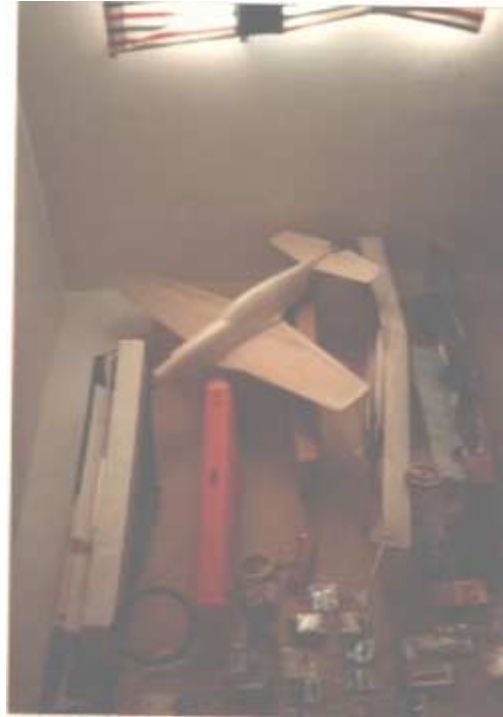
JERRY TREADWELL STUFF