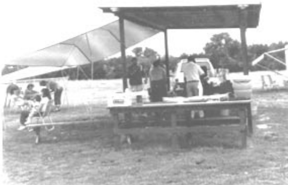
Our cook Fred Reese