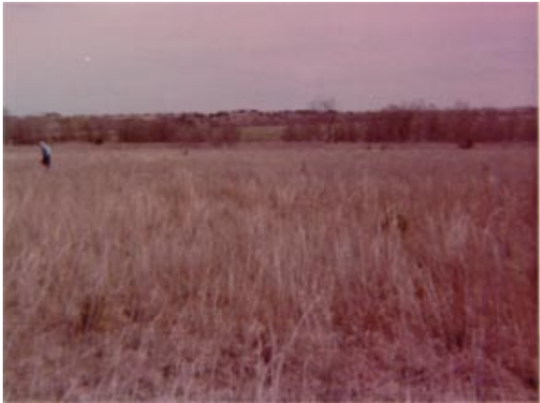
West of Killeen near Nolan Creek