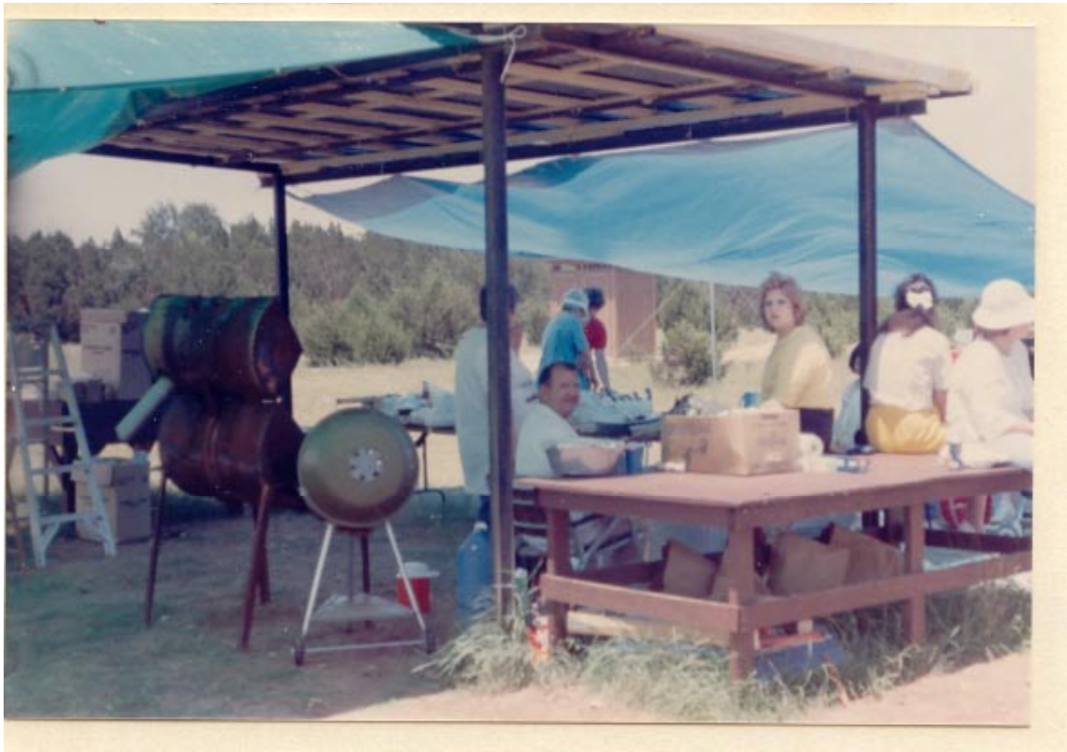
June 28 th , 1987 picnic showing the old pavilion