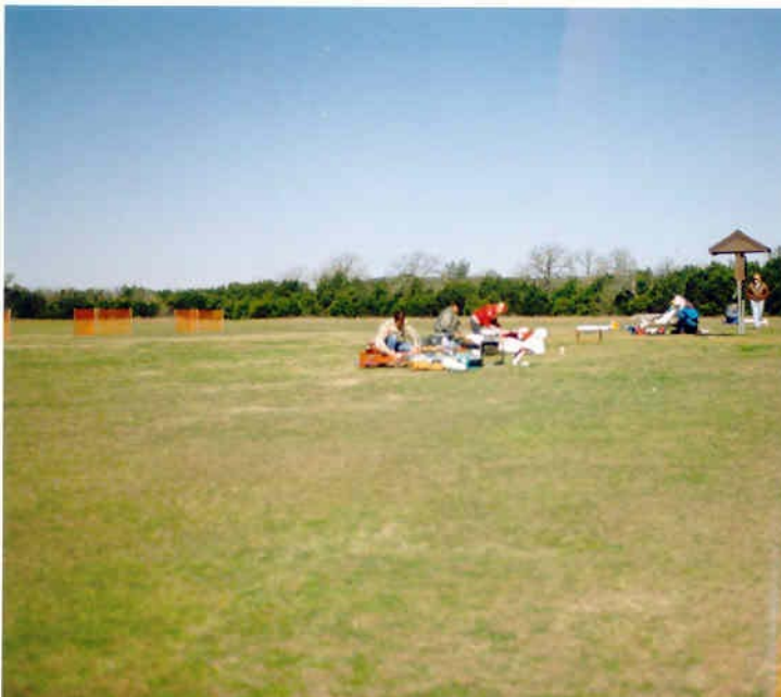
A DAY AT THE FIELD