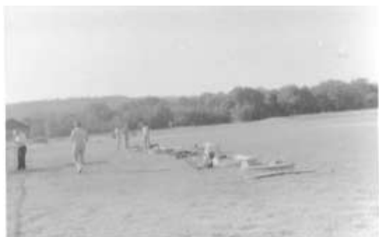
Sunday fliers February 1985