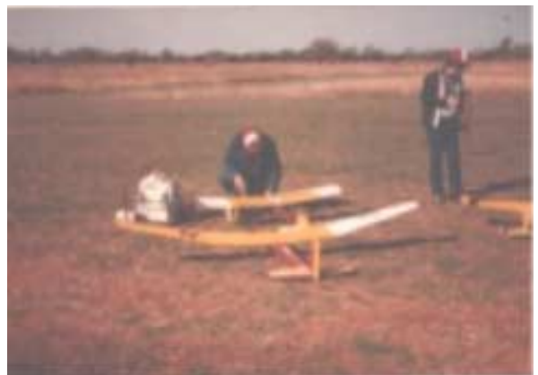
Earl Wolverton and Cho