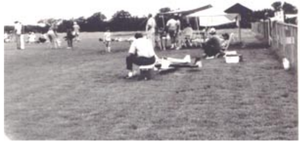
The flight line

Flying will take place all day Saturday and until noon on Sunday. The public is invited to attend and admission is free. Spectators are encouraged to bring lawn chairs for their comfort. Refreshments will be available at the scene.