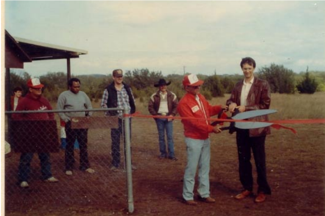
Ribbon Cutting Ceremony