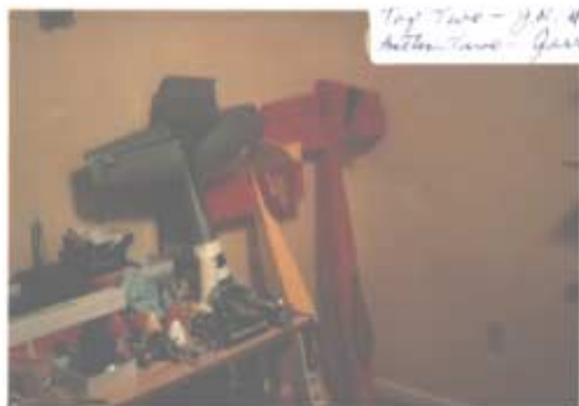
Top Tank - J.H. 4 Bottom Tank - Gary