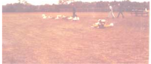
More models and members