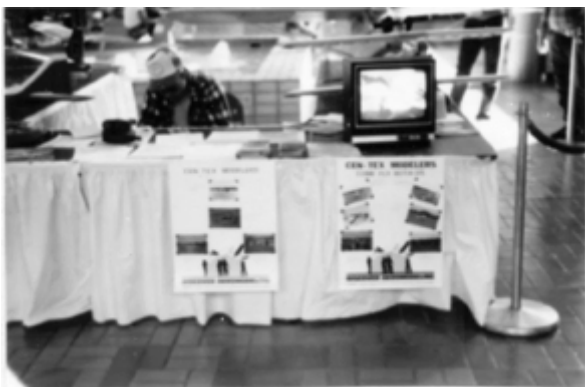
Killeen Mall Show, March 28/29, 1987

The two photographs below are of the setup for the March 28th, 1987 Mall Show at the Killeen Mall