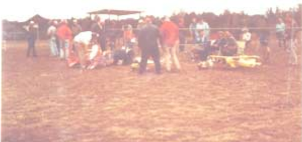
The line up of models and members for the event