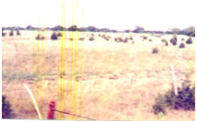
Found Flying Site at Union Grove Park West. Thanks to the US Army Corps of Engineers, and the Flying Site Committee.