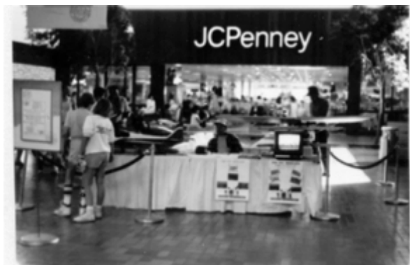
Killeen Mall Show, March 28/29, 1987