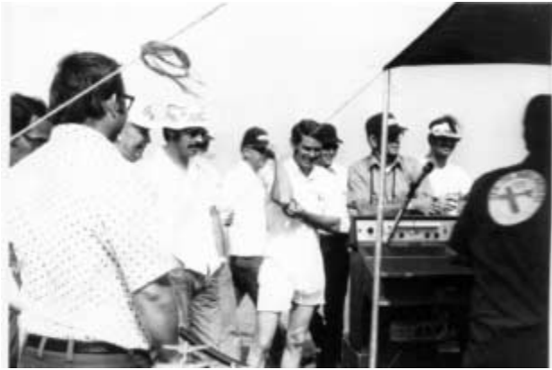
The pilots meeting before the event