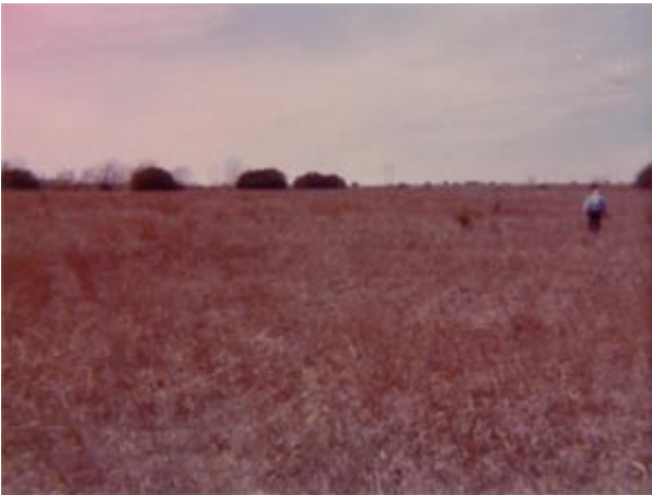
In the same area, but a different view