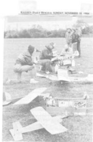
FLIGHT PREPARATIONS —Members of Cen-Tex Modelers Inc. Saturday morning prepare their radio-controlled crafts for flight at Union Grove Park West at Stillhouse Lake.