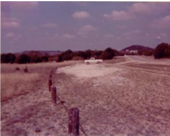
In the Dana Peak Park parking lot