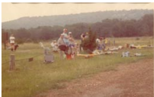
Our First Fun Fly at Union Grove Model Port