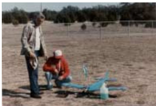
More Sunday fliers February 1985