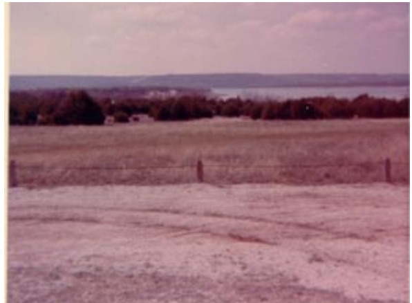
Looking from the parking lot across the lake toward Union Grove Park.