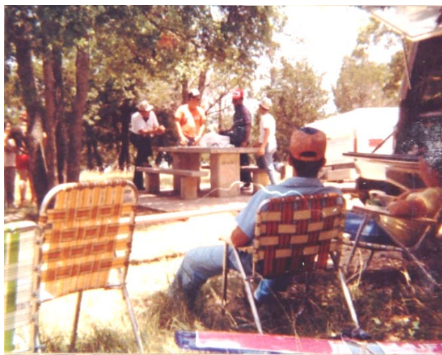
Cutting of the Cake.