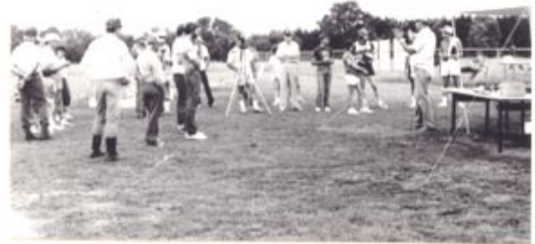
Handing out trophies