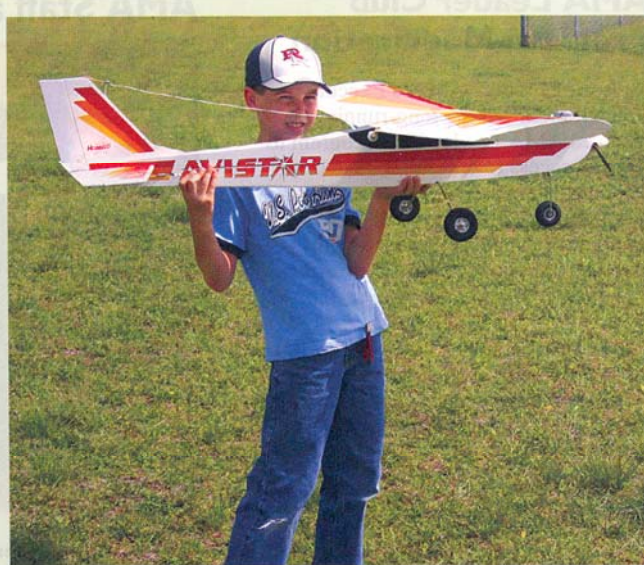
A proud son with the Hobbico Avistar RTF trainer the Cen-Tex Modelers donated in honor of his father who was killed in Iraq.