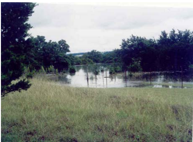
Looking North East from the field