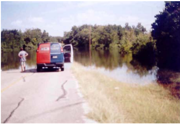
Road Entrance to Field