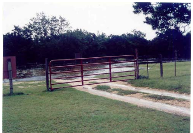
Water in the Parking Area