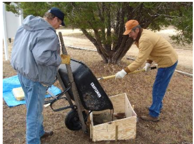
Pouring the concrete in the form