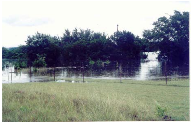
Looking towards the Camping Site