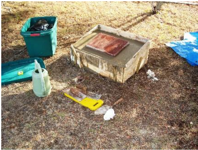
Letting the concrete set up