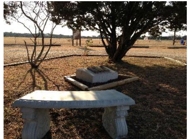
Name plates for former members.