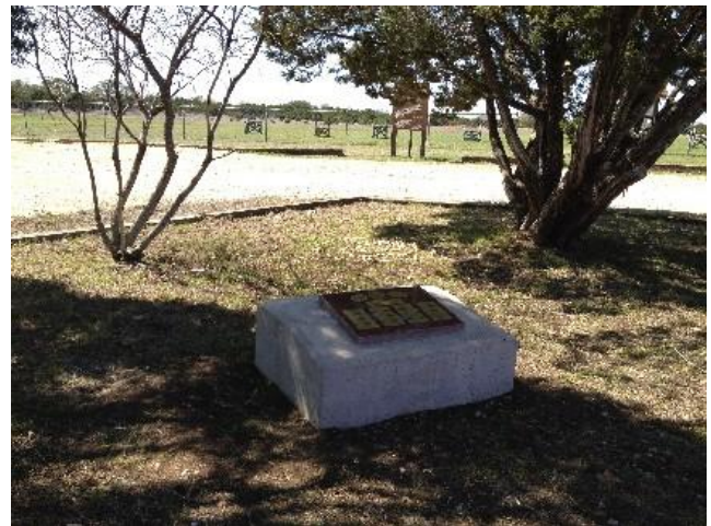
Finished project located in the turn around.