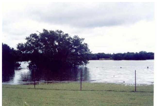
Good time to have a Float Fly Fun Fly