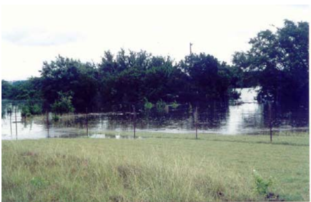
Water in the Parking Area.