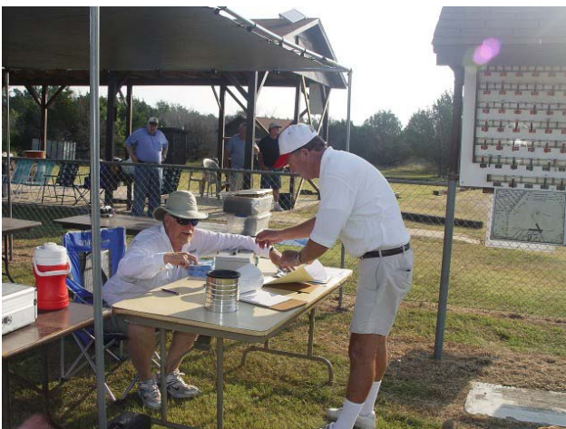
Go Raffle Ticket Sales