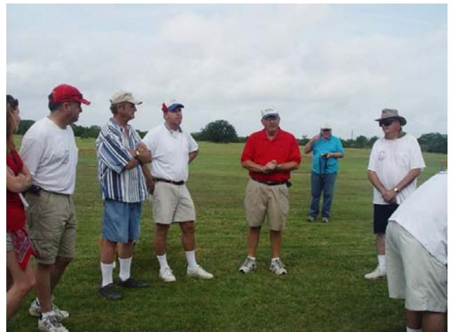
Rim Rise Introductions Remarks