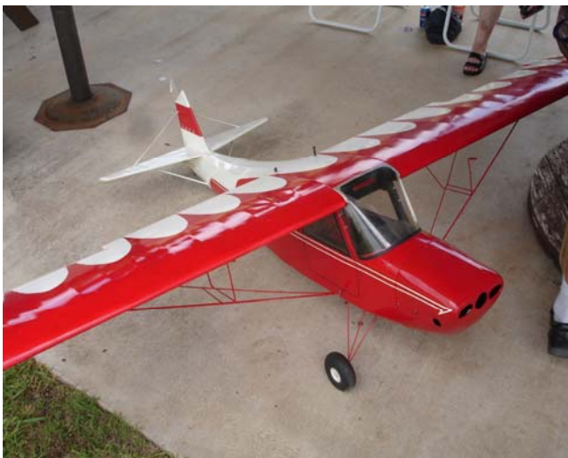
Fred Reese's donated raffle item