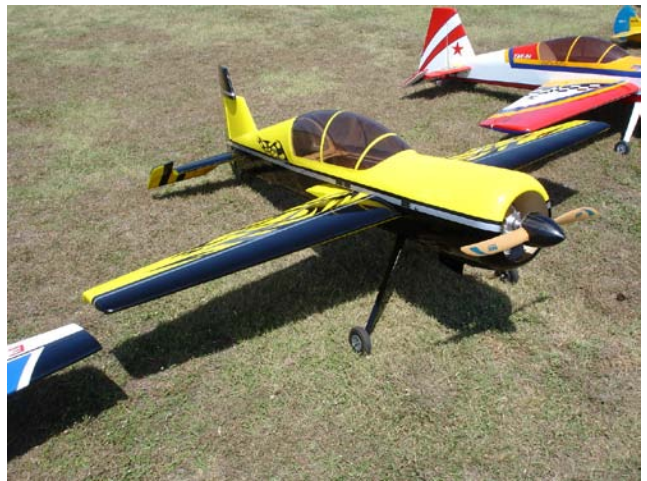
Line Up at noon for judging Pilots and Spectators Awards