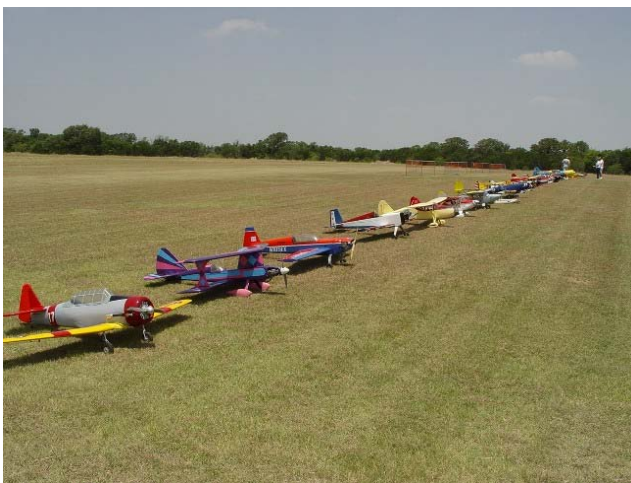
Lunch Time Line up for Judging