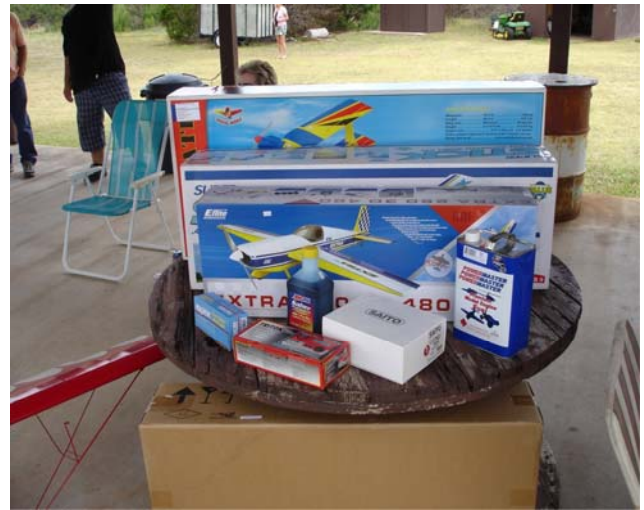
Eight items for Raffle