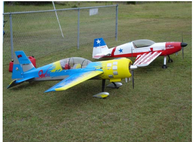
Richards Guy's good looking planes