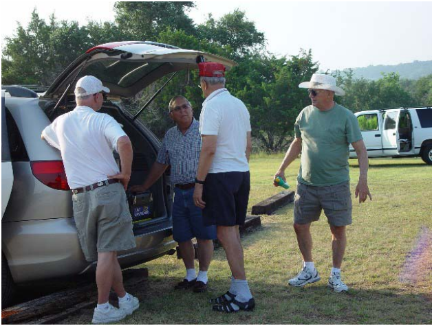
Visiting guest unloading