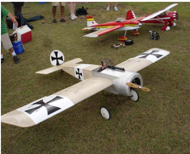
Dan Smith's plane