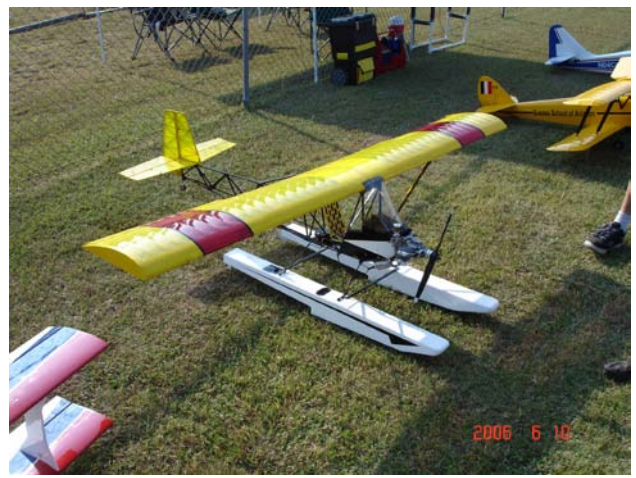
Jerry Beaty's Home build ultra light (Spectators Choice)