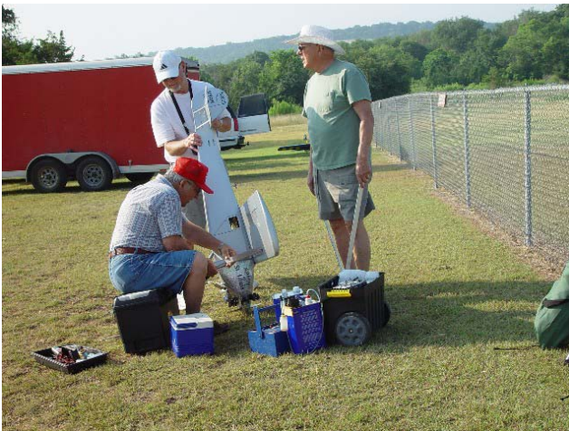
Guests setting up