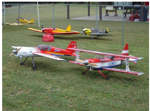
A few of the entries