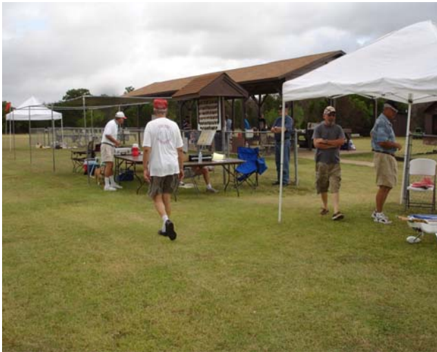
Early Morning Set up