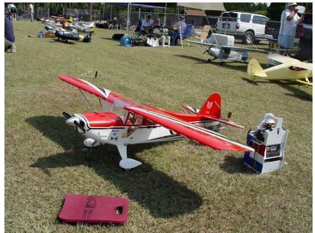
The Clipped Wing Cup by Taylor Craft w/a Twin OS 160 with smoke belongs to Don French