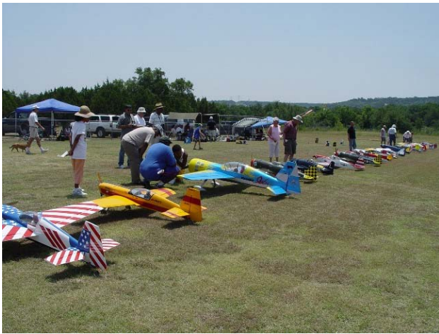
Lunch Time Line Up for Judging