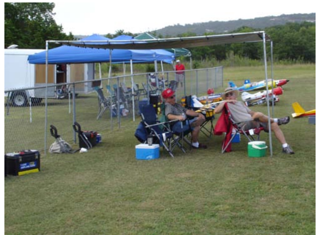
Enjoying the Shade