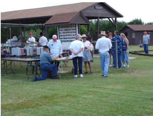
Raffle sales were busy all day long