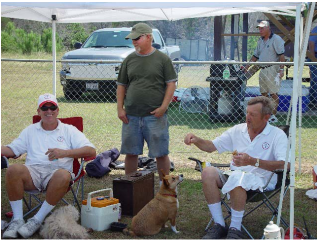
Even the Dogs are enjoying the activities