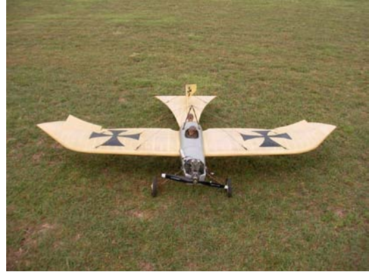
Bob Hall's nice WWI vintage aircraft