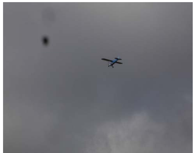
Club in flight