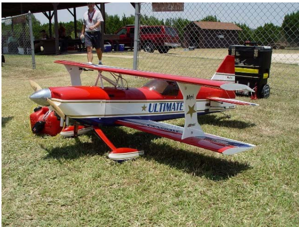
The Ultimate w/a BM E50 Eng, 65" WS belongs to JohnEyre