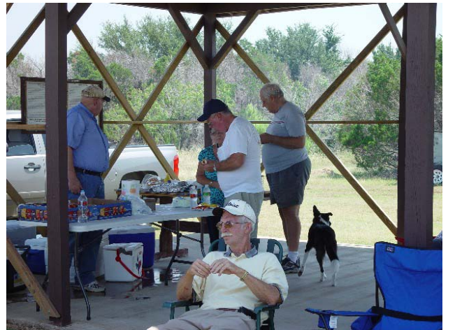
Enjoying Lunch, Hot dogs and Burgers