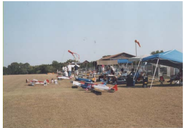
Part of the Line Up