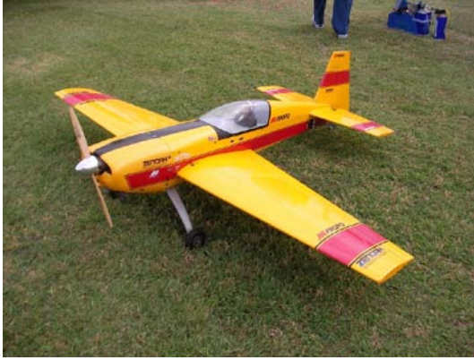
Jim Hillin's nice plane