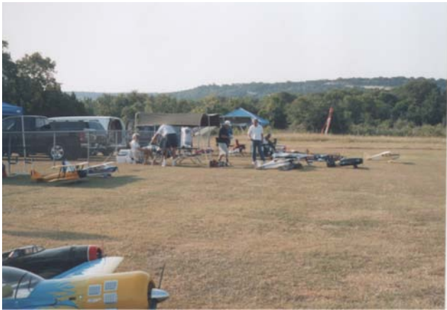
George Town Gang setting up