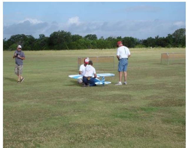
Setting up for flight