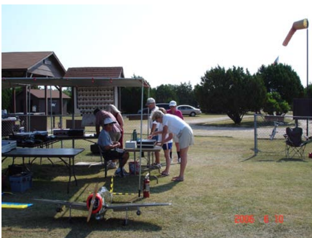
Activity at Registration