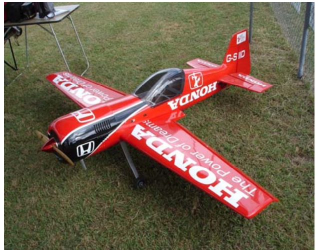
Jim Hillin's Plane