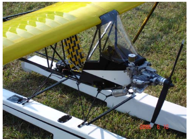
Another view of Jerry Beaty's ultra light