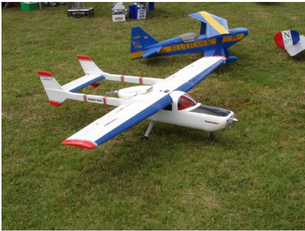
Nice twin electric before the crash