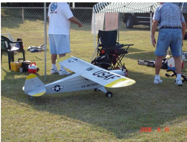
Dan Smith's Super Cub Plane