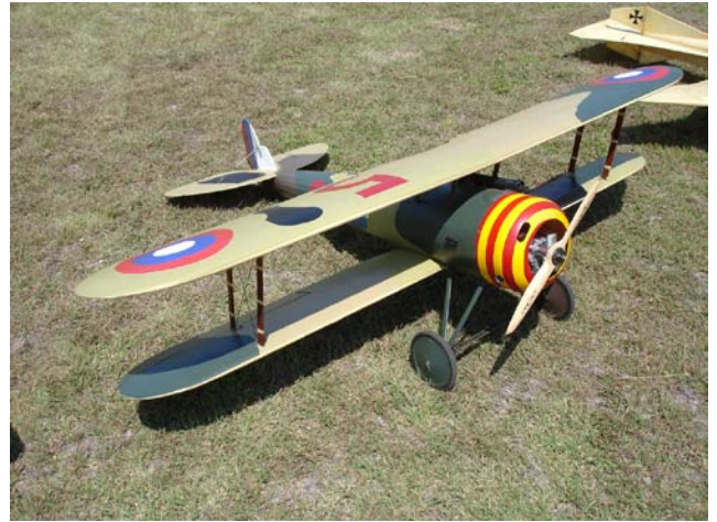
John Halls Pilots Award