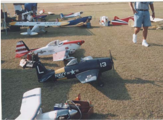
Part of the Line up at lunch