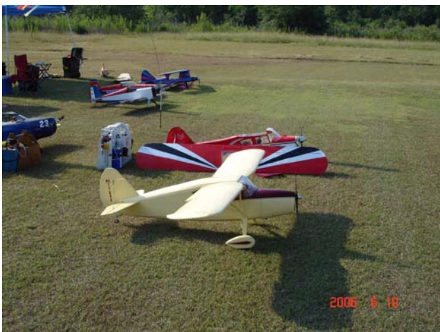
George Town Club Members Planes