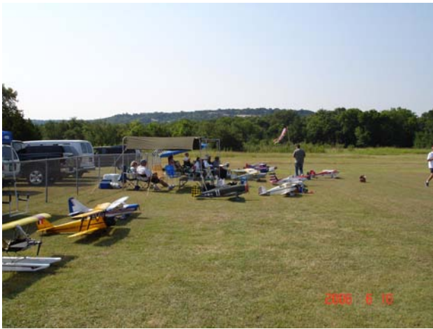
George Town Club members