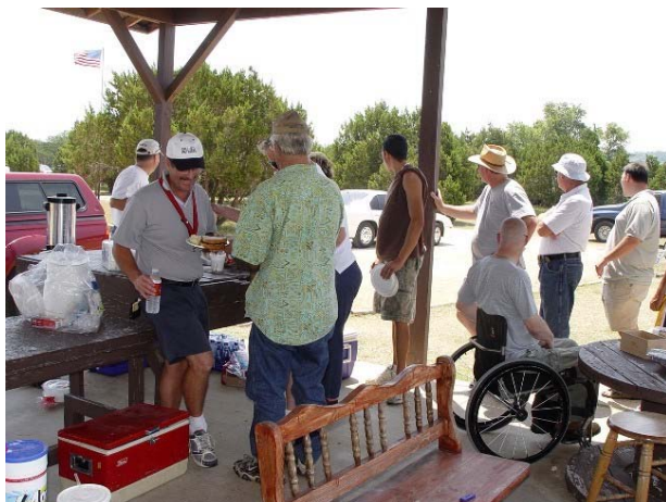
Lunch Time Great BBQ