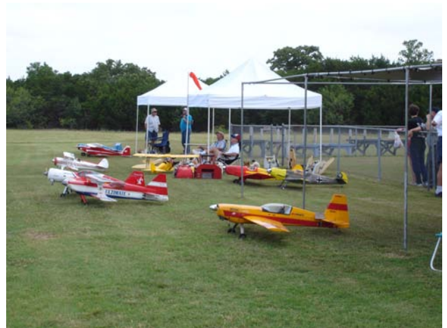
Part of the Line Up