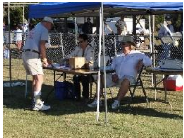
Slack time at registration