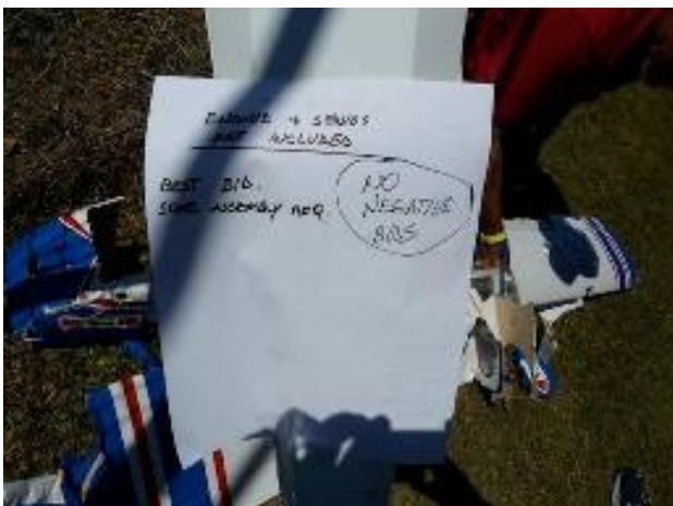
As the saying goes. NO BULL S....!!