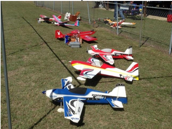
Lined up for the Judging