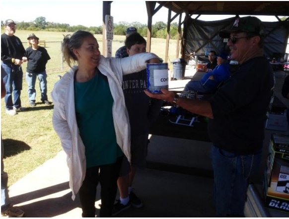
And the lucky number is??