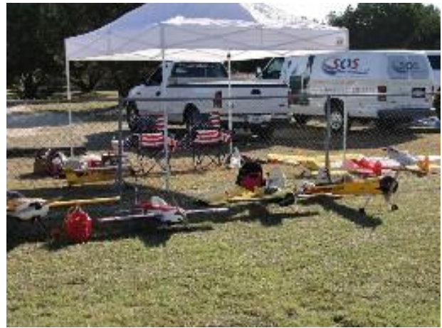
Setting up and waiting for flight time