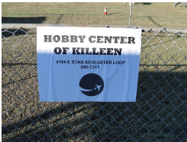
First Hobby of Killeen