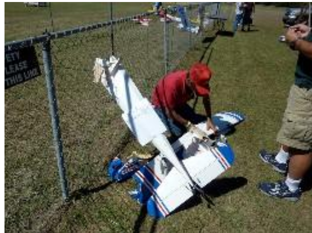
Paul stripping his plane of the radio equip and back to flight school