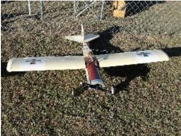
Another Silent Auction Plane