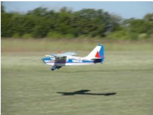
Paul's plane on a landing approach