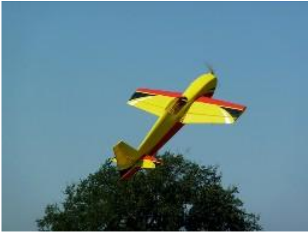
Flying to perfection