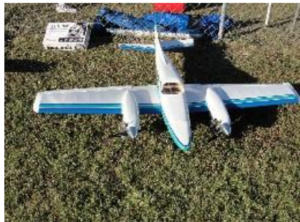
Silent Auction Item