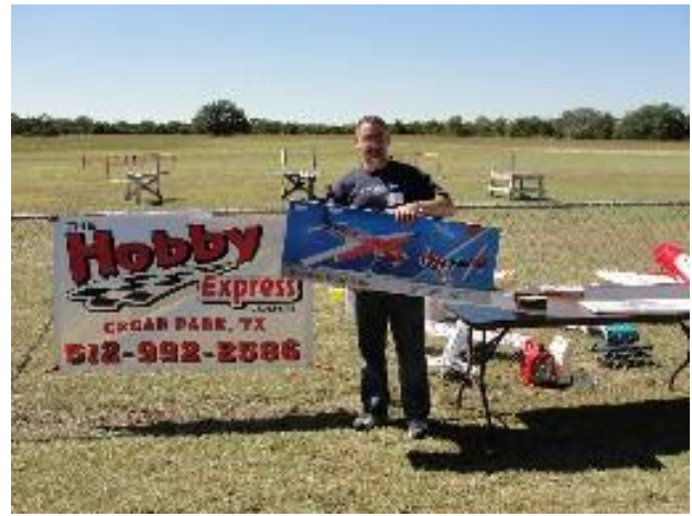
Happy Prize winners