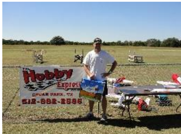
Winner's of raffle prizes