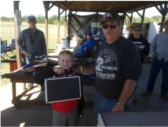
Another Lucky Winner