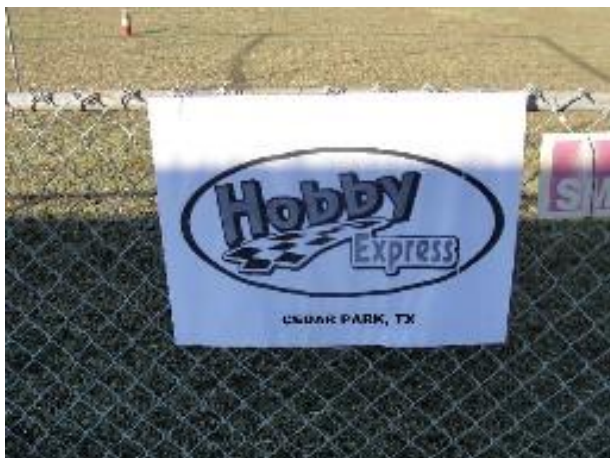
Second Hobby Shop contributor