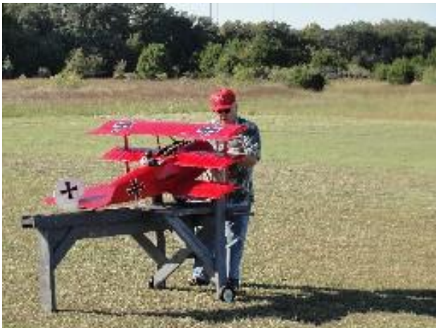
James lands' great looking Planes