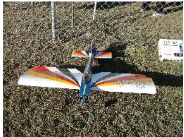
Last of thre silent Auction Planes