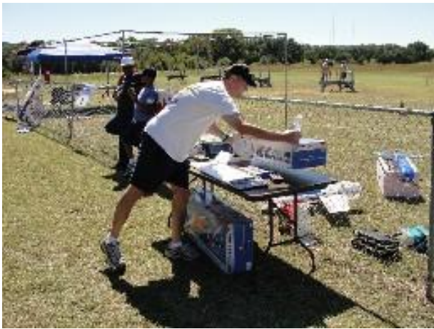
Pilot looking over prizes