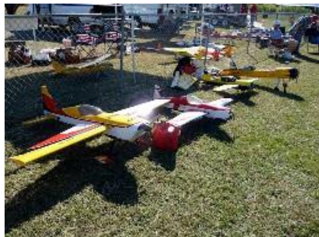
Nice Plane's on display