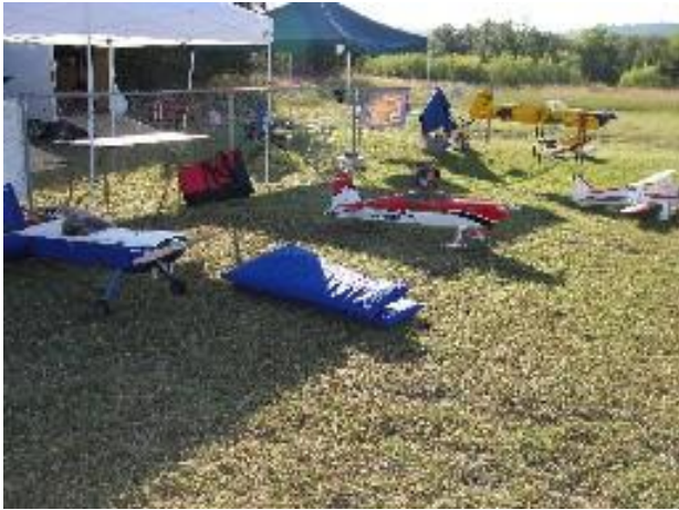
Setting up of Visitors