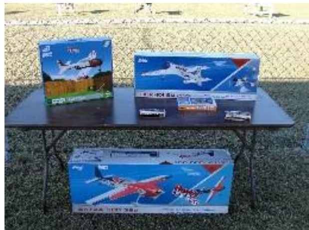
Raffle Items contributor