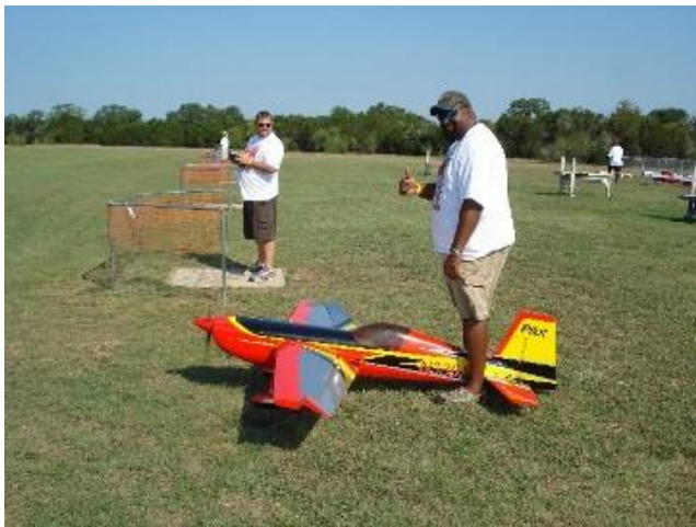
Bill P. Extra 330 SC W/ DLE 55 cc