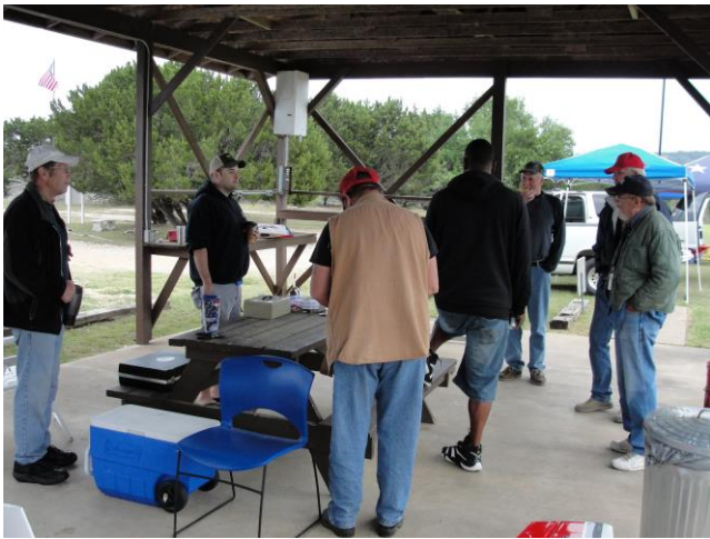
More of the gang