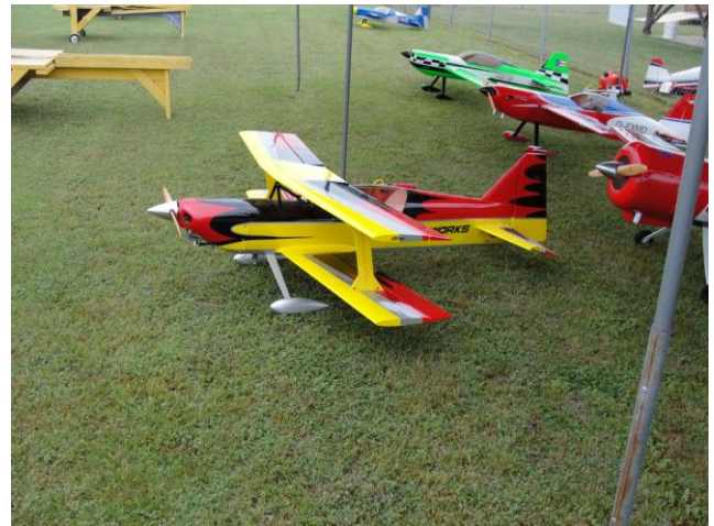
Jim Hillin's Plane