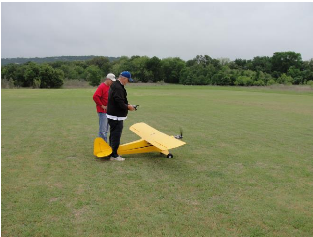
Ready for take off