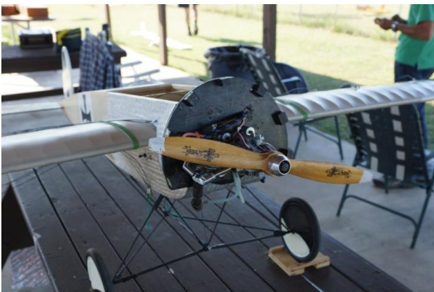
Another view of Hubert's Eindecker