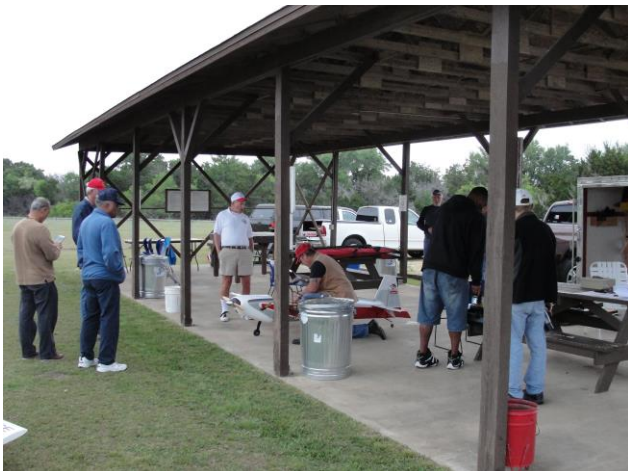
Part of the gang setting up