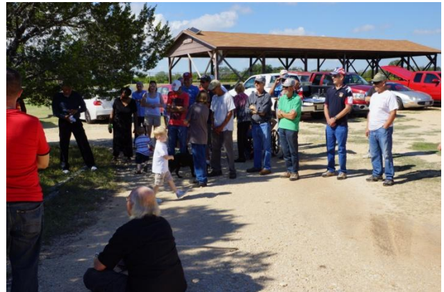
Those in attendance for Memorial