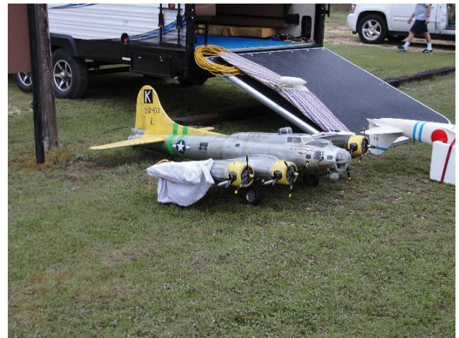
B17 from Austin Club