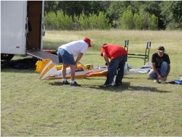
Unloading and setting up