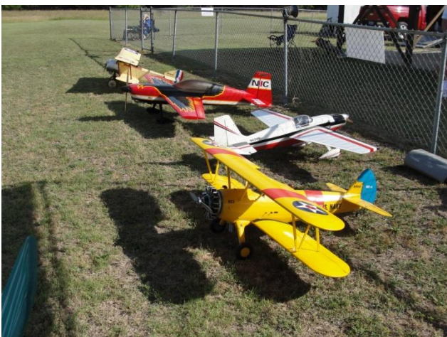
Part of the aircraft line up