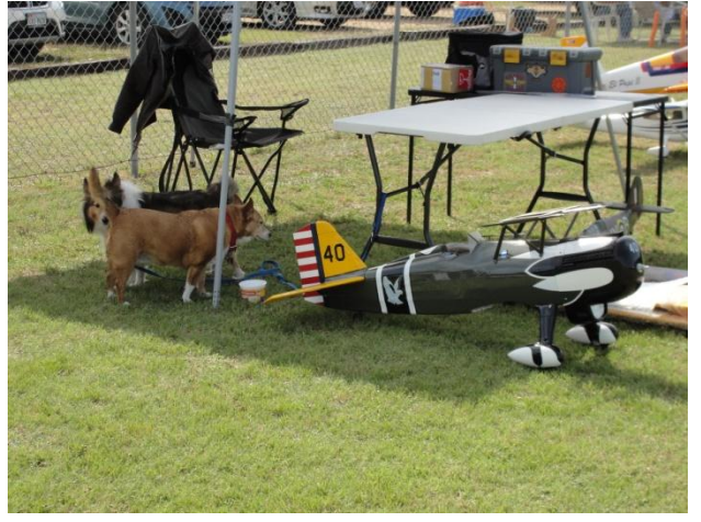
Looking for fire hydrant