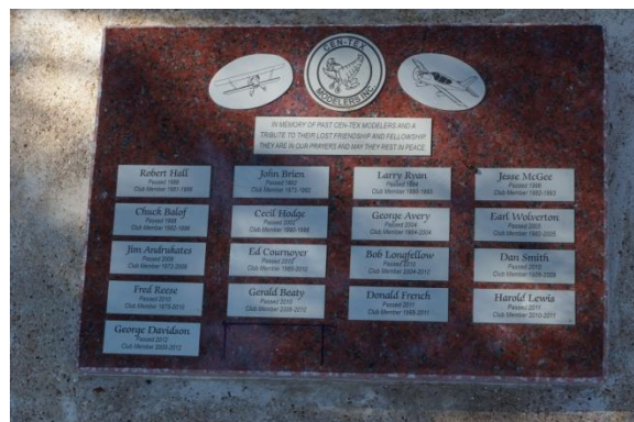
Clubs Memorial Remembrance Plaques