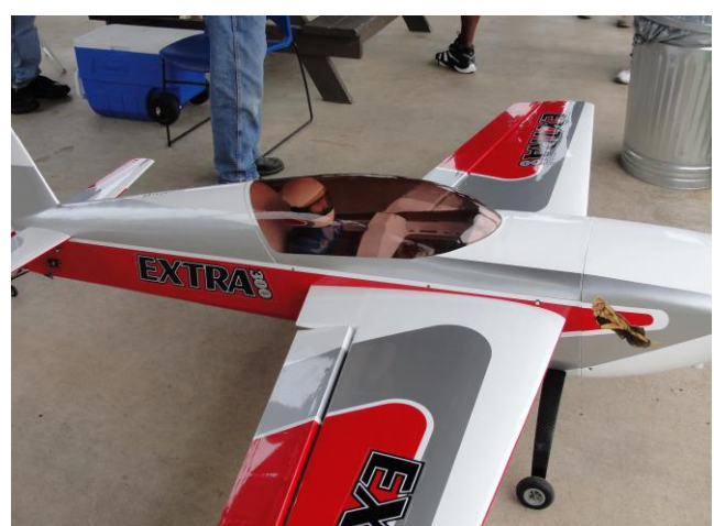
Breakfast of Champions