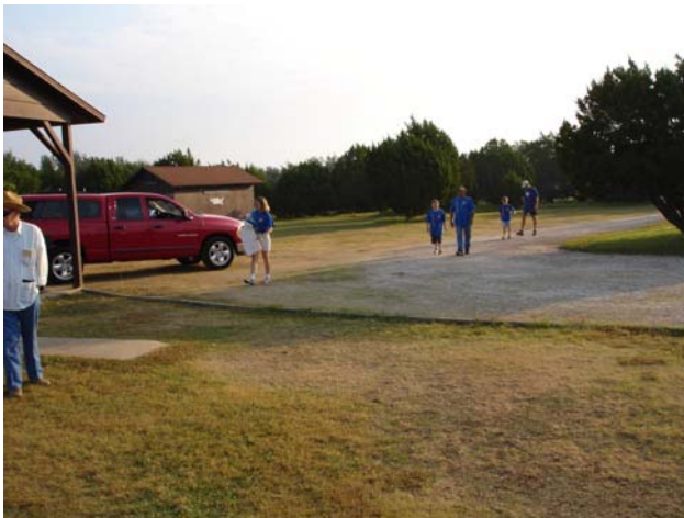
Early Arrival of the Scouts