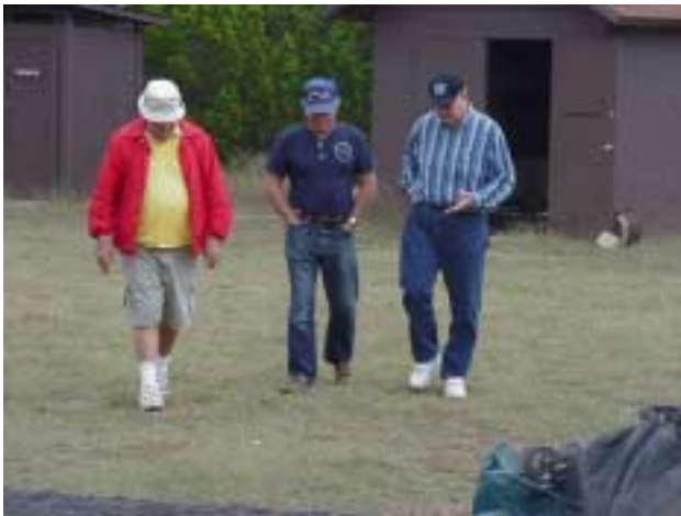
George Town Club Members