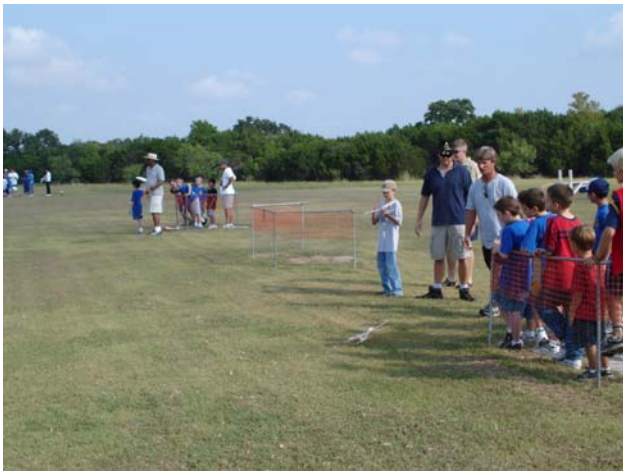
Scouts on the flight line with gliders & rubber power planes