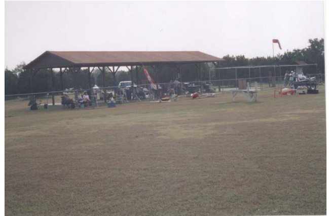
Before the Scouts Arrived