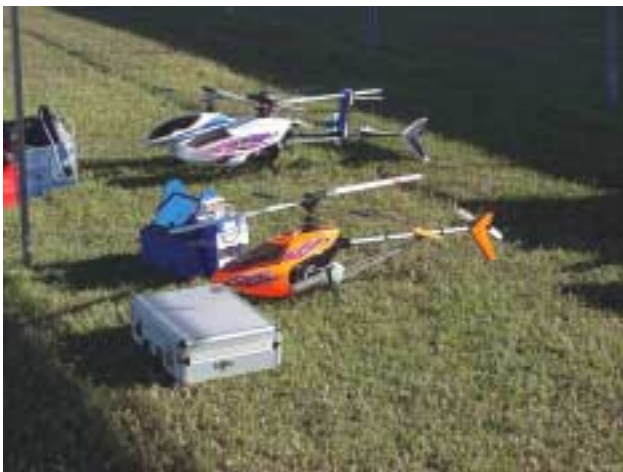
Three of the Choppers