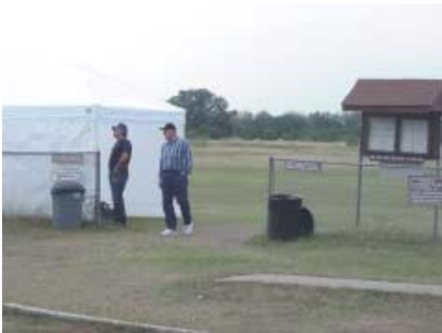
Wonders what they are looking for???