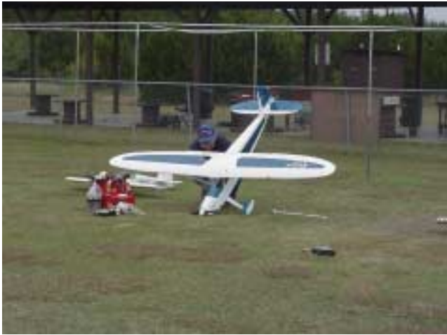
Now where was that CG located at, Hmmmmmmm