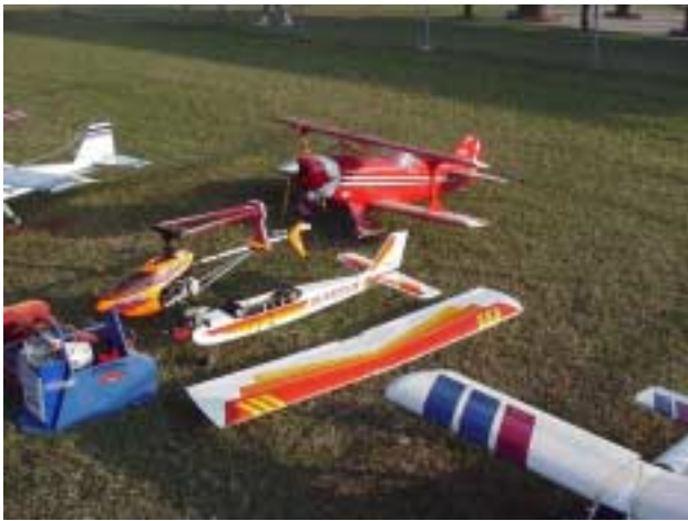
Jim Hillin's Eagle Bi Plane