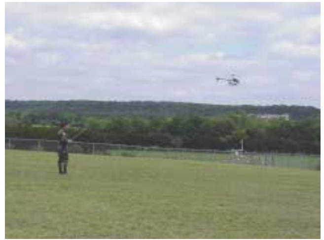
Charles Farlow's Flight Demonstration of Chopper