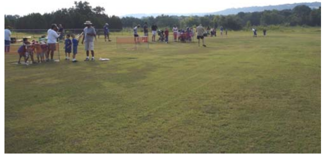
Flight Line of 3 of the 4 groups