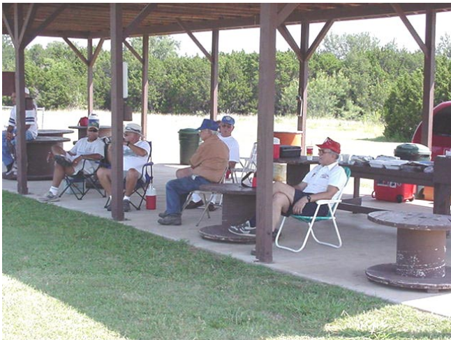
GATHERING OF EAGLES