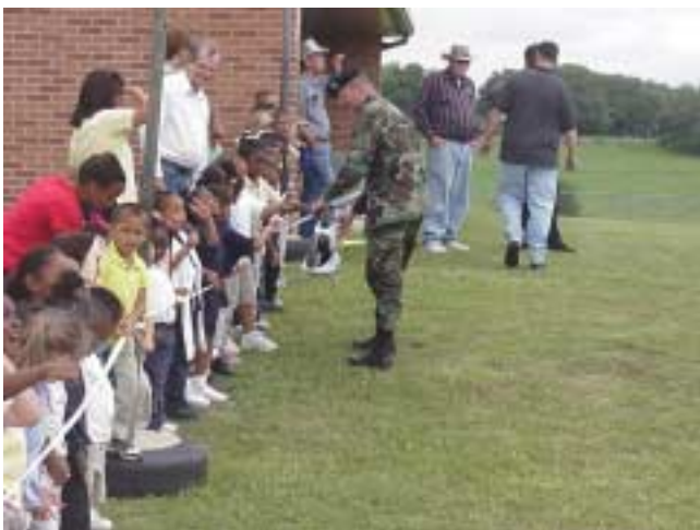
Touch and Feel for Kids