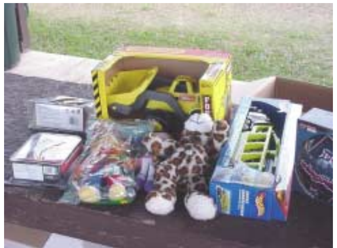
More of the Xmas Gifts