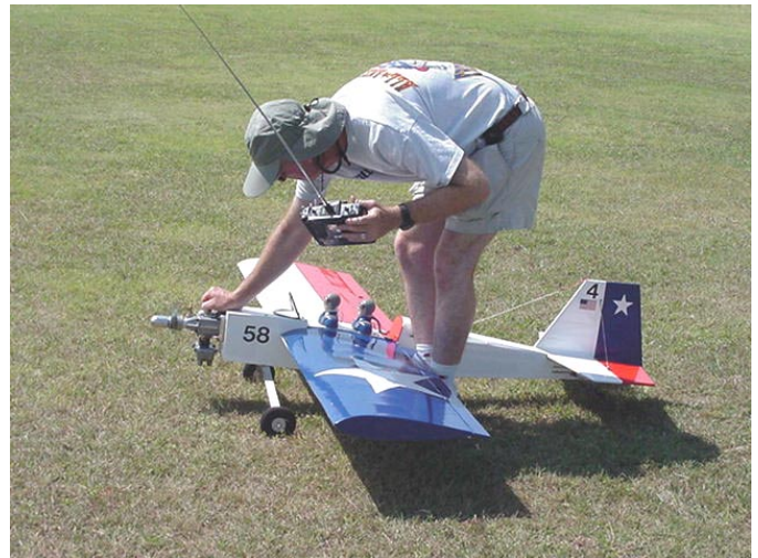
BILL BECHTOLD – WATCH THE FIGURES