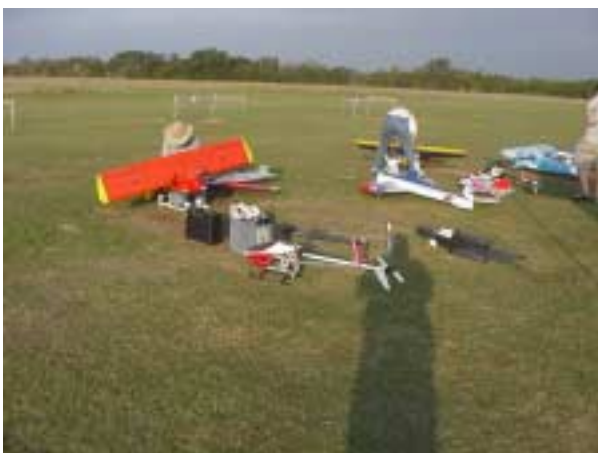
PREPARTION FOR THE DAY'S FLYING