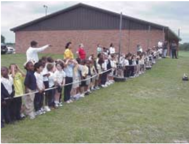
Outside Demonstration Line Up