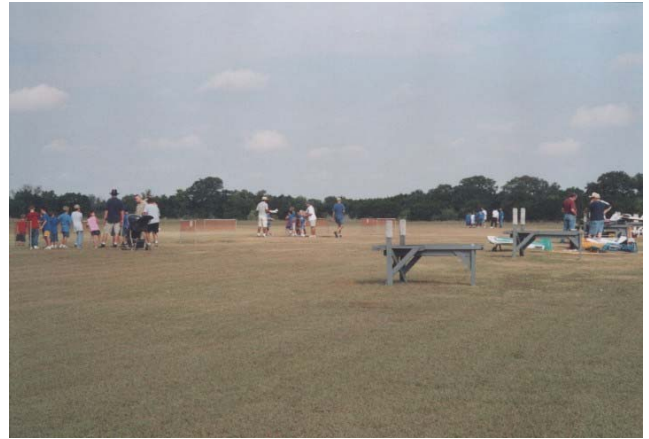
3 of the 4 participating scout groups