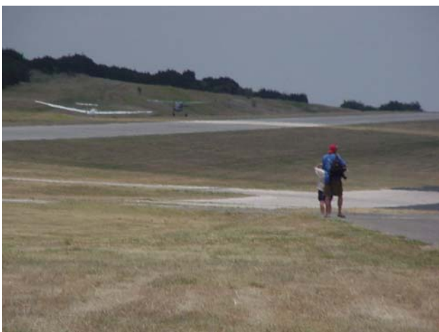
Glider and Tow Plane are off