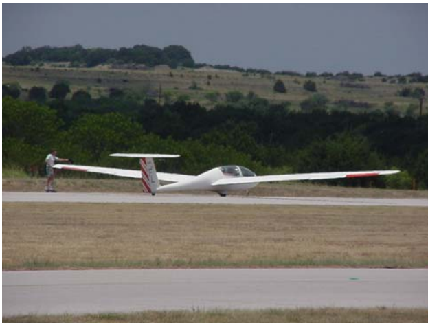
Glider ready for take off