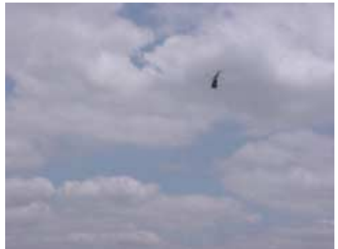
Helicopter in Mid Flight