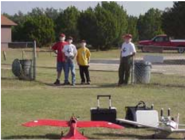
Scouts enjoying the flying