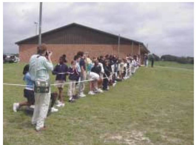
Kids outside for live demonstration