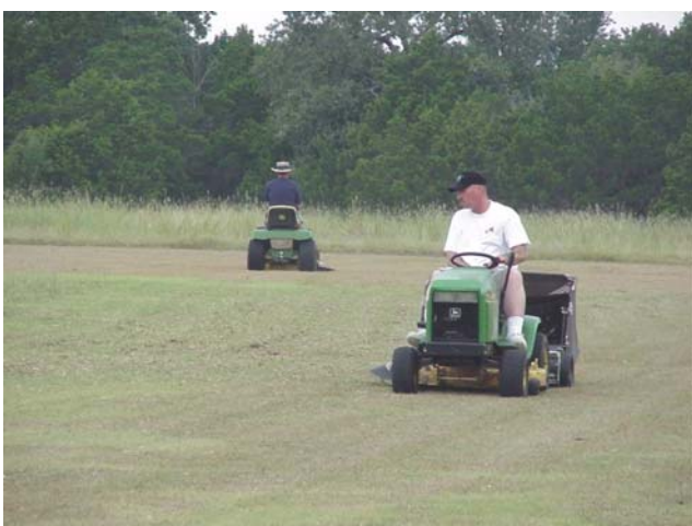
Tractor Races ??