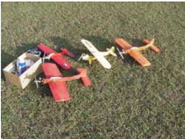
Bob Haas's yesterday's version of Big Birds – Control Line Planes