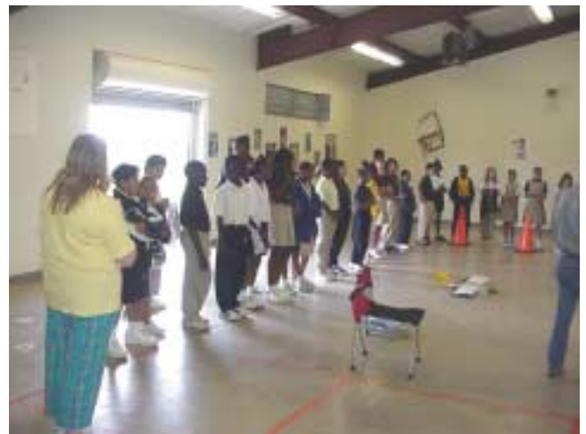
And More School Kids