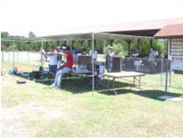
The Gang Again