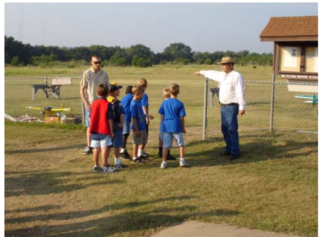
Robert Hass's Introduction to the Days Attractions