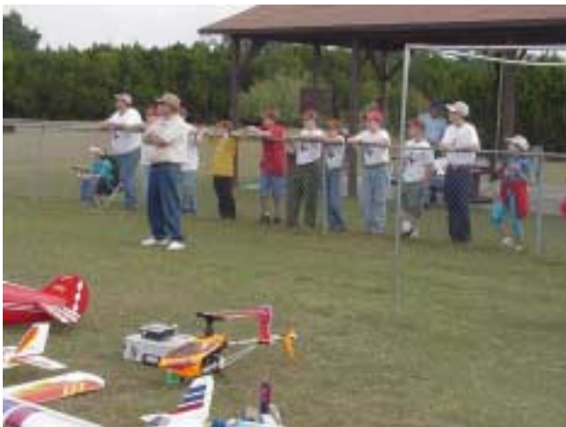
Scouts and adults enjoying the great flying