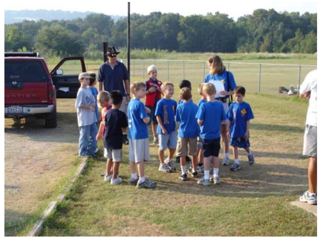
Scouts forming into four groups