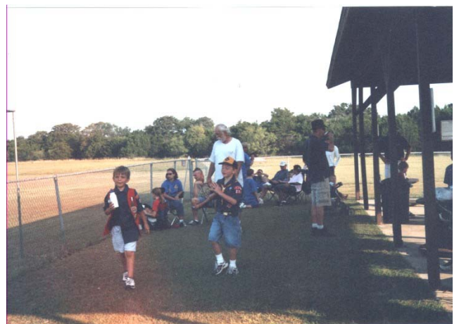
Scouts Gathering together