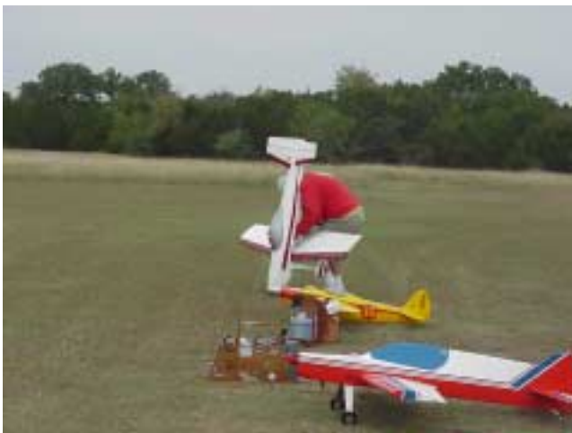
Dan, you need a bigger plane if your going to fit in it or Lose some weight.