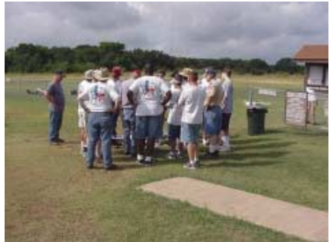
Meeting of Scouts