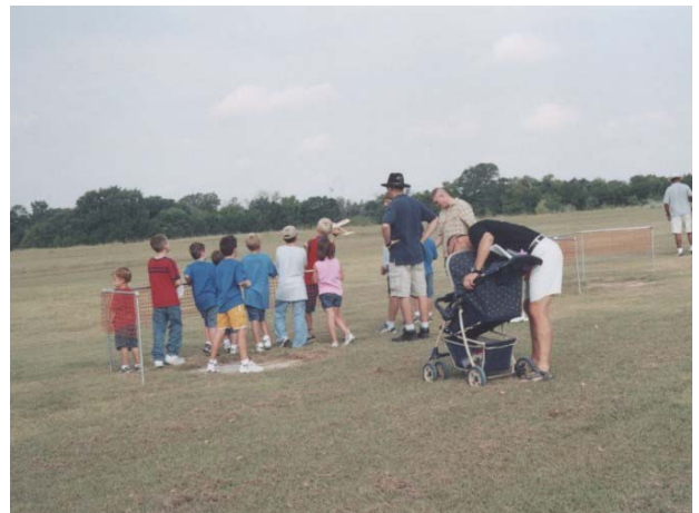
Scouts participating in glider toss