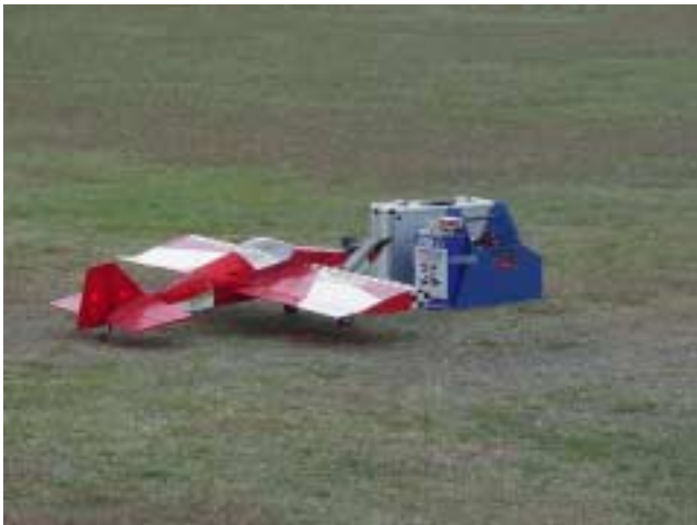
Jim Hillin's Plane