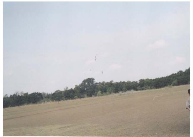
Rubber Band In The Air