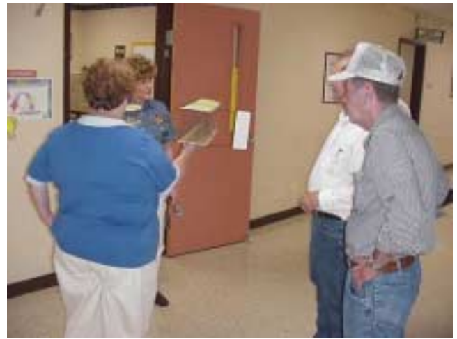
Presentation of Wright Brothers Flyer to School