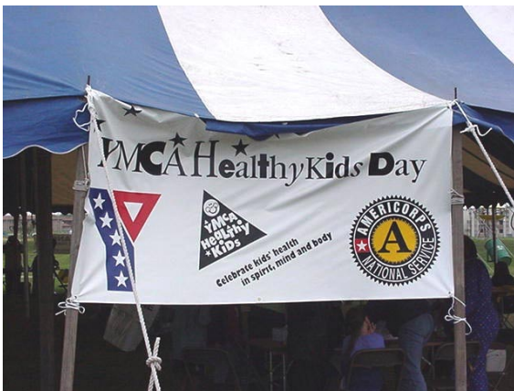
EVENT WAS HELD OUT DOORS IN TENT