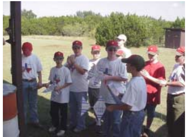
Scouts showing appreciation for days events