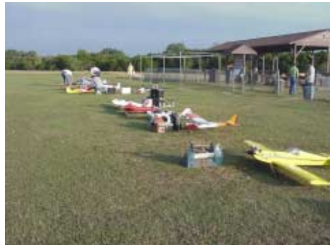
THE LINE UP