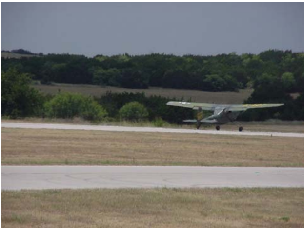
Tow Plane Lift Off