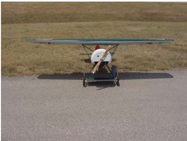
Ed Cournoyer's Static Display

Seventeen members of the CEN-TEX MODELERS INC attended the annual Lampasas Spring Ho, held during the week of 3 – 10 July 2005 in Lampasas Texas. A demonstration was held at the Lampasas Air Port and was hosted by the Lions Club of Lampasas. There were many spectators in attendance along with flights by full size guiders, along with static display of other full size aircraft. All that attended had a good time and was enjoyed by all.