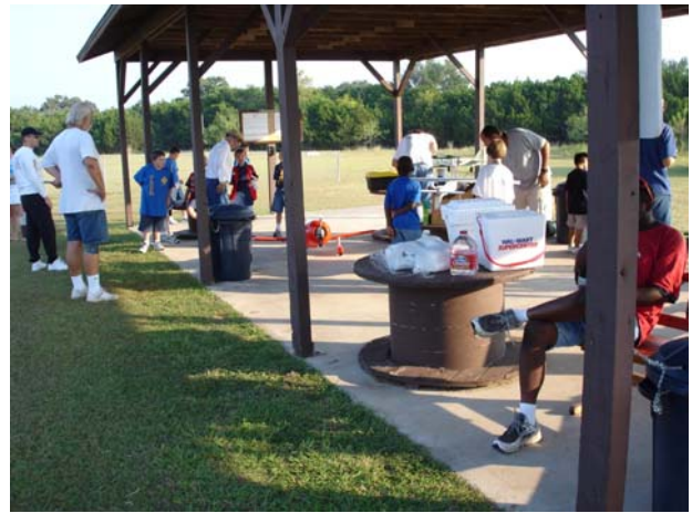
Scouts and Leaders Getting Settled In