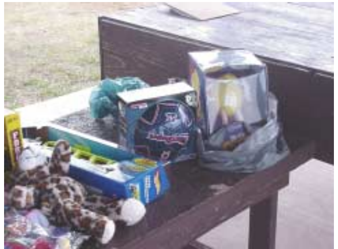
Some of the Xmas Gifts