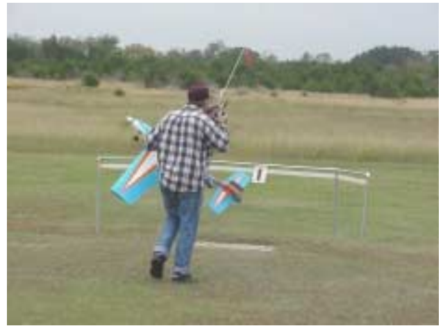
I knew I should have brought more hands with me.