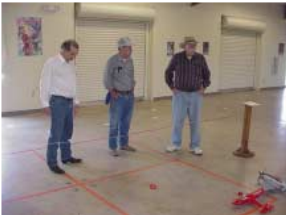
Waiting for first group of school kids