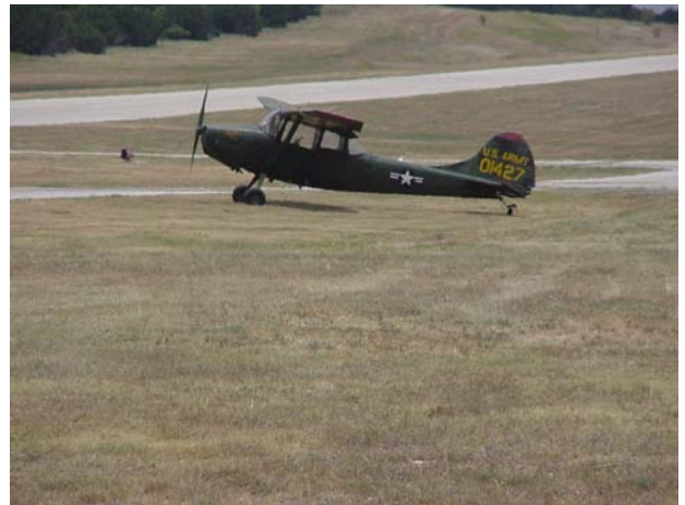
Glider Tow Plane