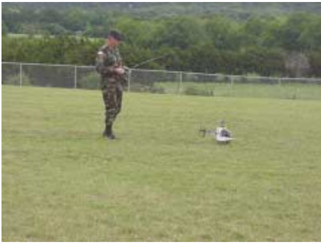
Ready for Take Off