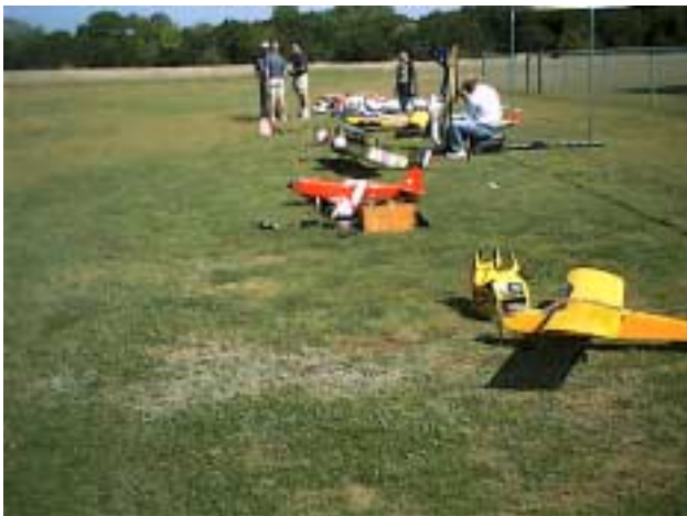
The Line Up

Our annual picnic is history. The morning started a little chilly, but the day warmed nicely with only about a ten mile per hour wind, slightly cross wind of the main. We received several compliments on the bar-b-que, with the club purchased from Texas Style Bar-B-Que on 38 th Street in Killeen. Several when back for seconds so not much was left. We didn't count the number of flights, but the photographs below were furnished by Frank James, and reflect the number of modelers in attendance. Unfortunately, at least aircraft suffered damage. Without naming names, one stalled out on approach (due to wind shift) and the tree at the north end of the runway reached up and grabbed the second aircraft. We had several visitors including Jan Hodge, who's really not visitor, and Allen Crawford, who is not a modeler at this time. We wish to thank Allen and Eric Remoy for their donations to the club treasury.