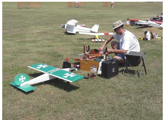
UNKOWN SETTING UP FOR FLIGHT