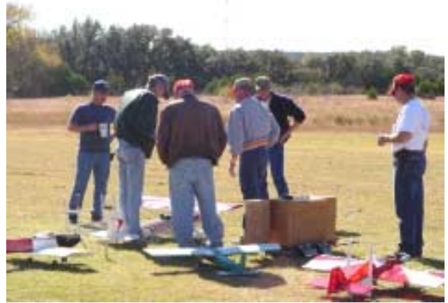
You Dropped What Where