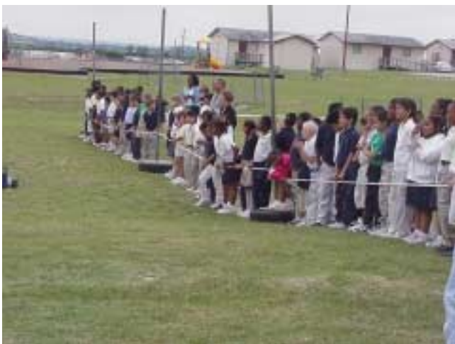
And they just kept on coming