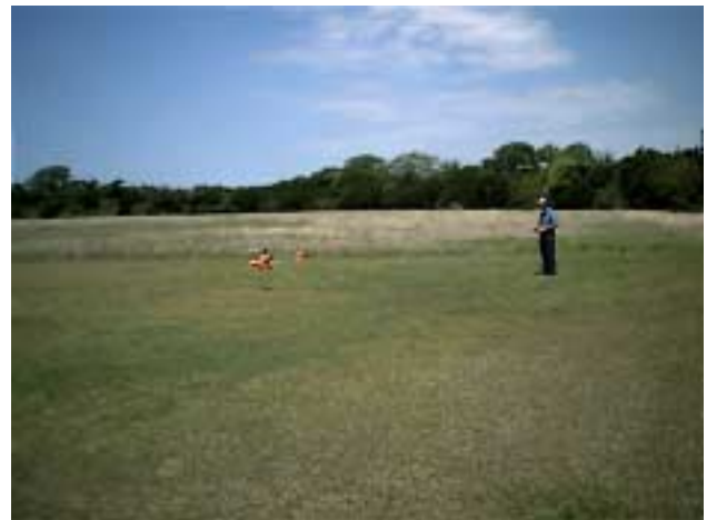
Jim Hillin can fly Helicopters??