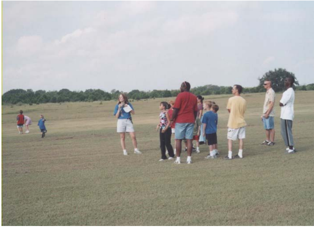
One of the Scout groups having fun with glider toss