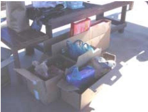
Toys Toys and Toys