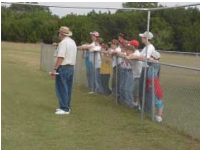
Scouts watching the buddy box flying