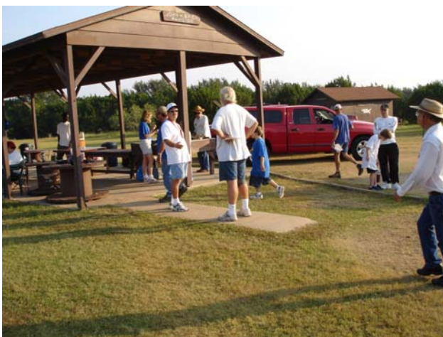
Club Leaders Welcoming Guests