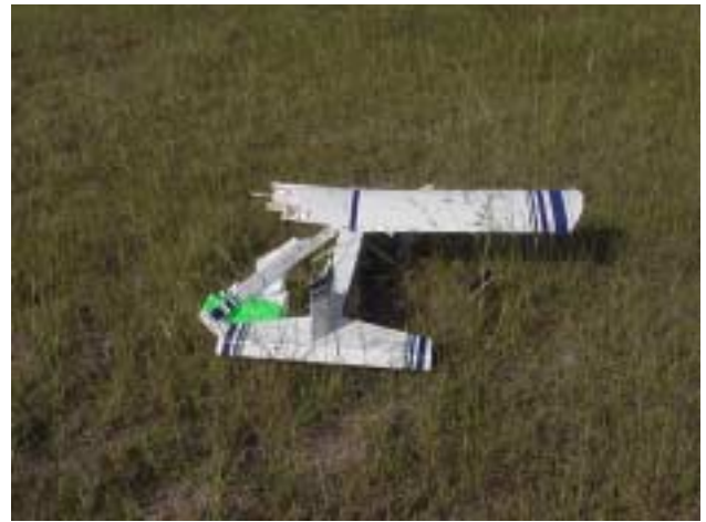
A picture is worth a 1000 words!!!