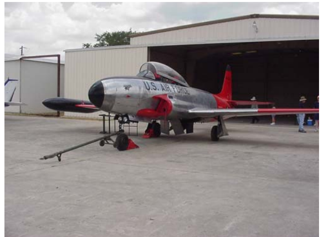
Full size static display