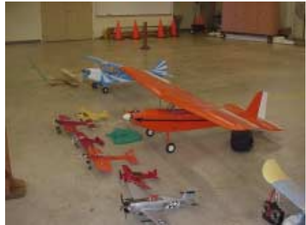
Line Up of Static Display