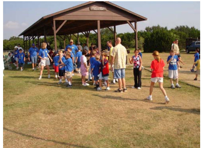
Gathering of the Pack