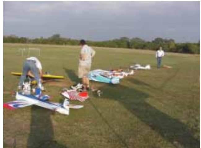
THE LINE UP IS FORMING