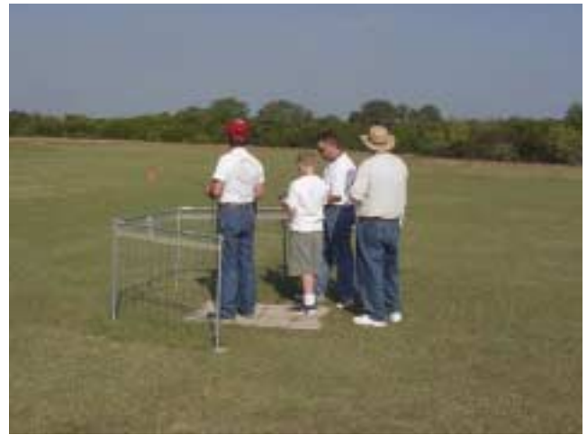
Scouts on the buddy box getting stick time