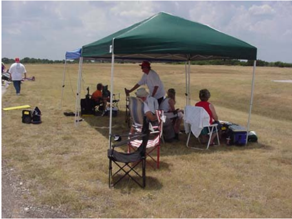
Members trying to stay cool