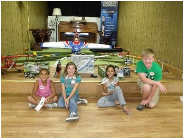
At CTM Hall Field for a flight demonstration