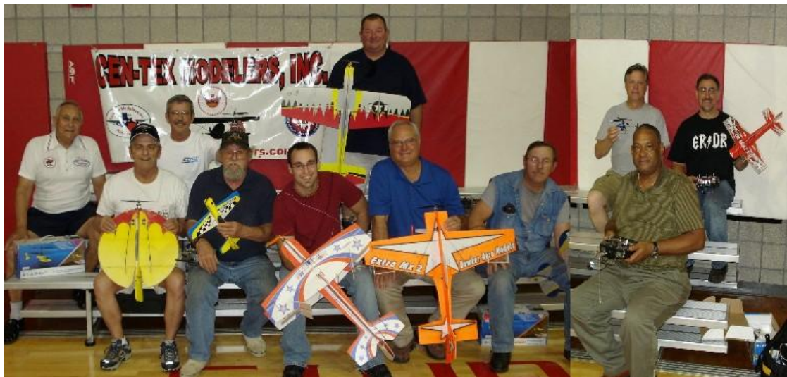
CTM Group Picture