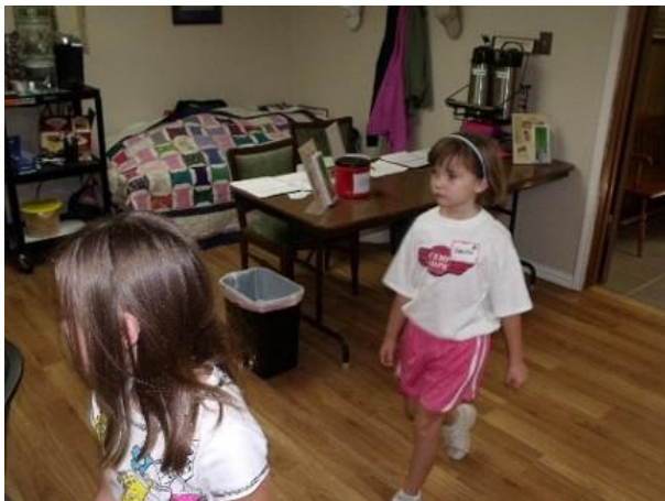
Ready for the day