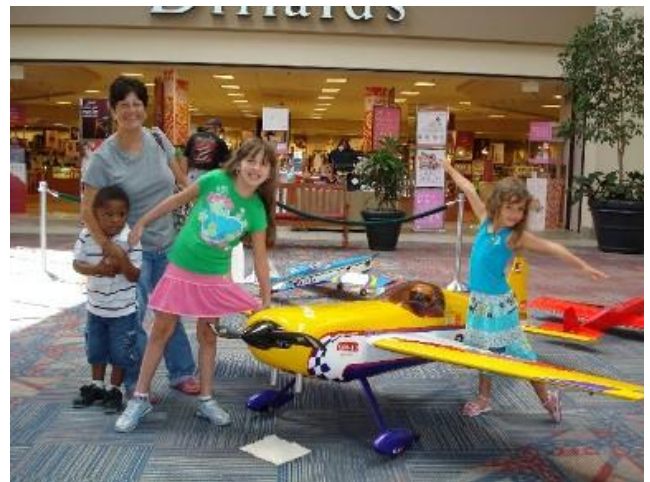
A picture for the album. Now Smile !!!!!!!!!!!