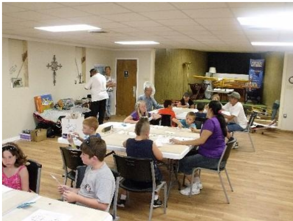
Working Tables for the Kids