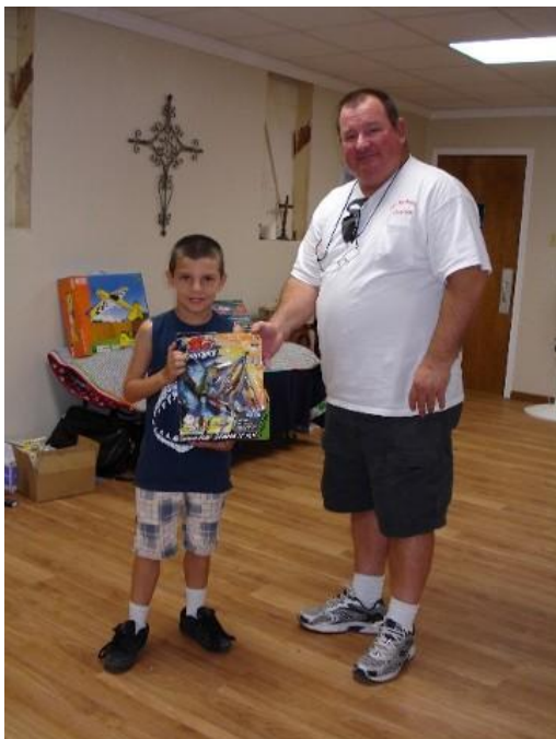
And the Winner is in the furthest distance flying contest