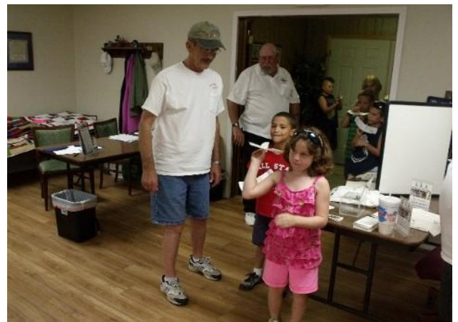
The Girls giving it a Shot