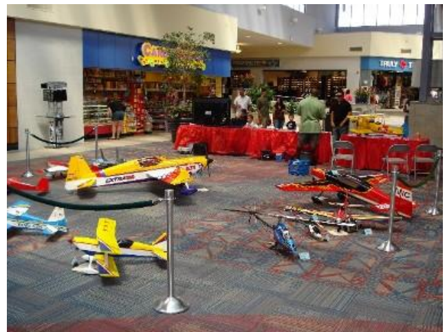
Models on the display