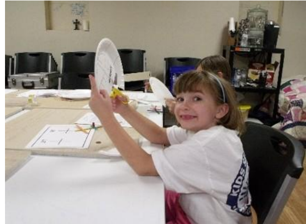
Sir. I am doing it right?