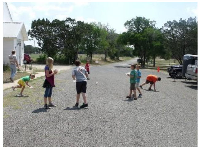
Flying on the outside