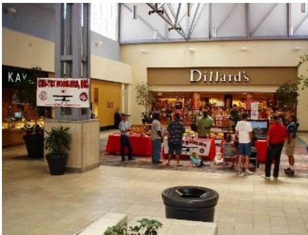
CTM on Center Court