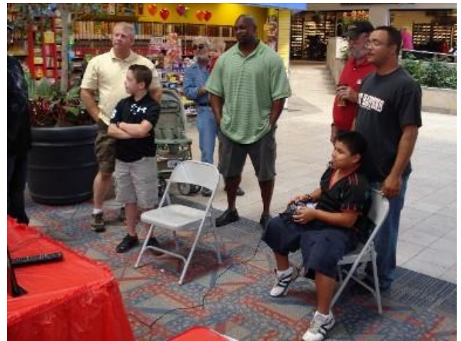
Bystander watching the Youngster on the Flight Simulator