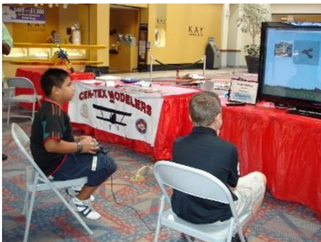
What It's All About