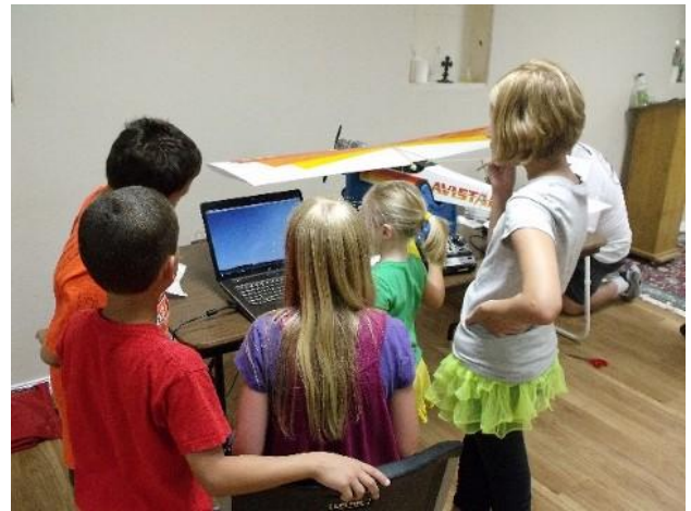
Future Pilots on the Flight Simulator