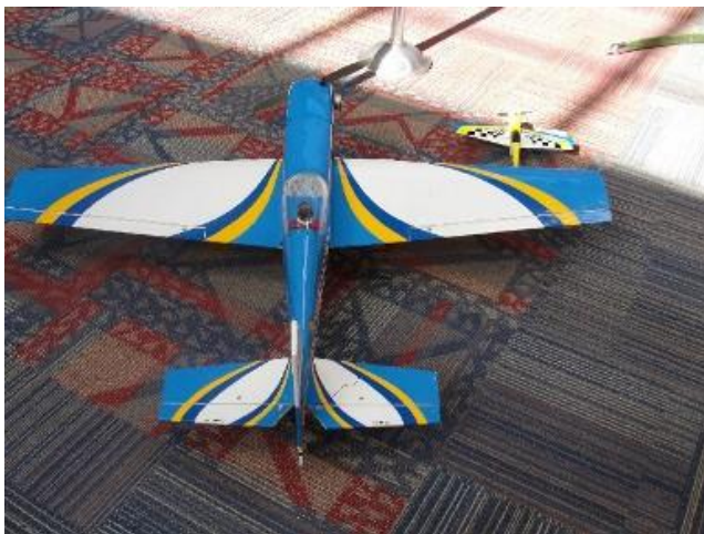
Butch Spradling's Extra 300