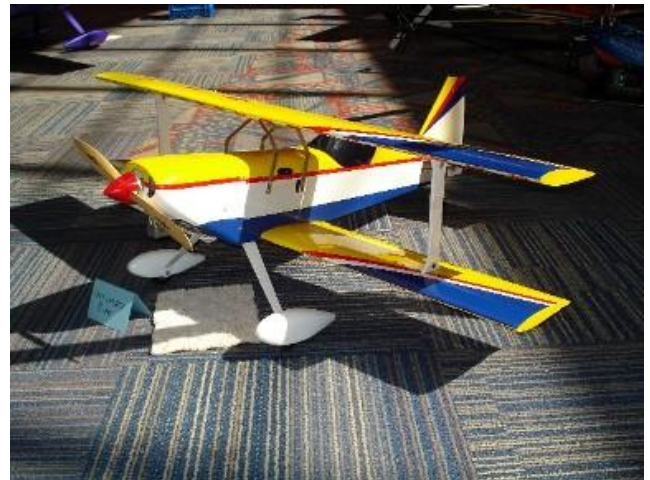
The Ultimate from Butch Spradling