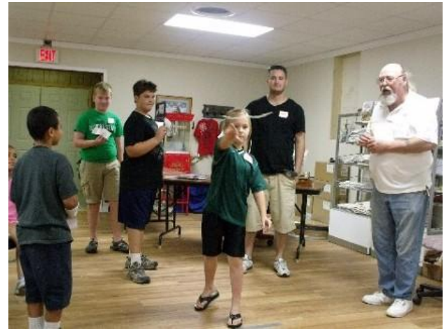
The Winners of each group