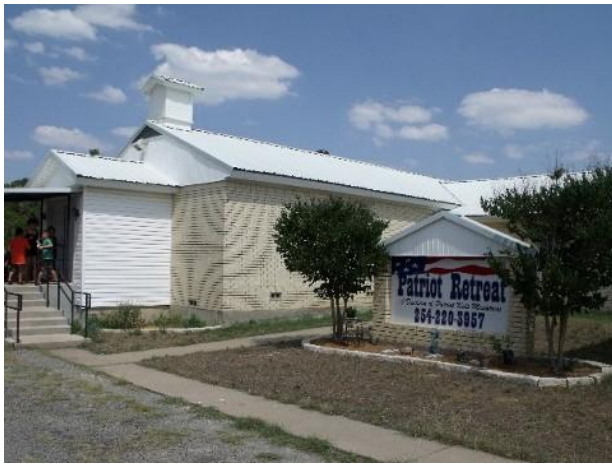
Patriot Retreat Ministries