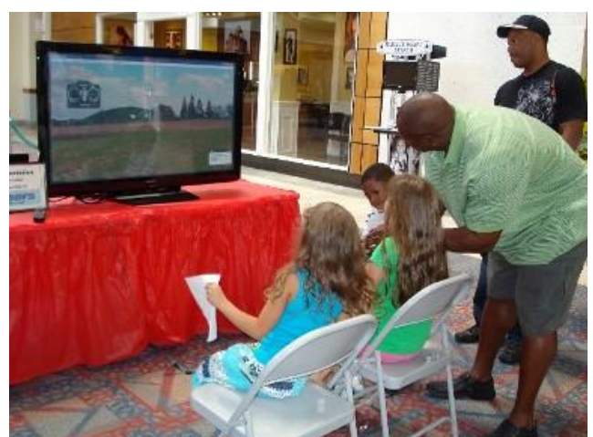
Two young girls getting instructions on Flight Training