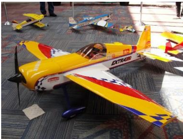
Terrance William's Extra 320