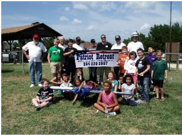
Group Picture at Hall Field