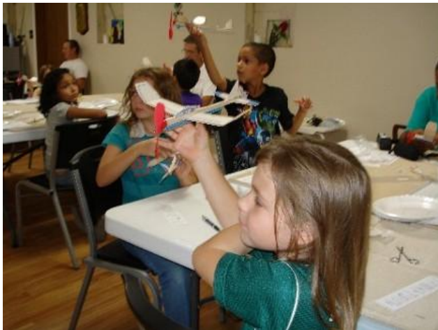
Will it fly ??