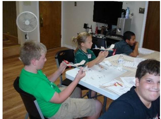
Will those Fly ??