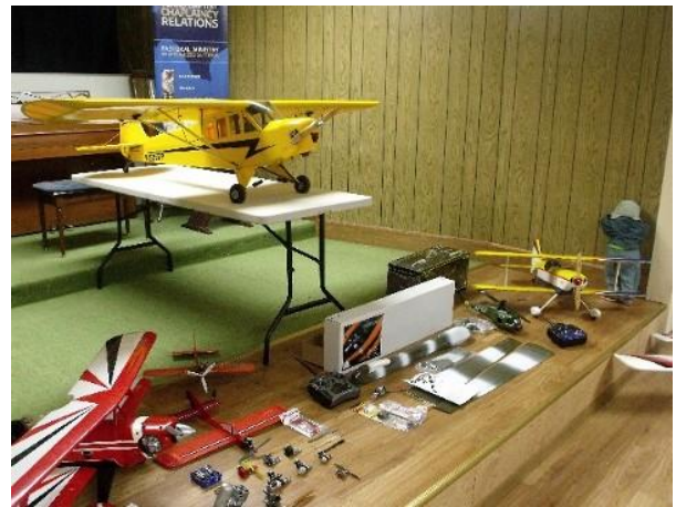
CTM Models on display