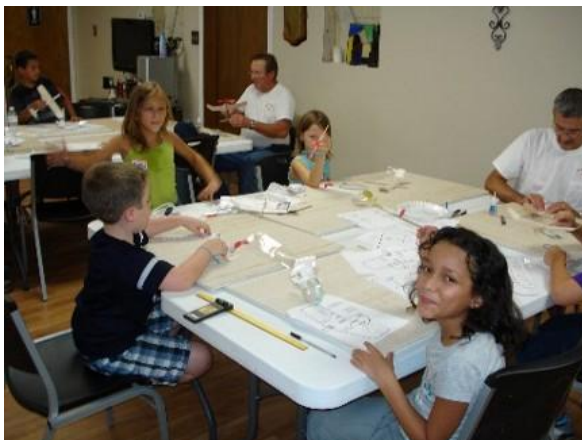
We are ready