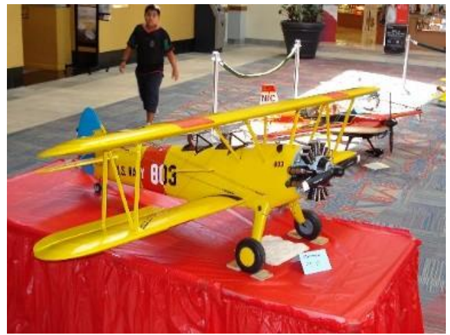
The Radial Mog-Up Engine consists of over 450 parts