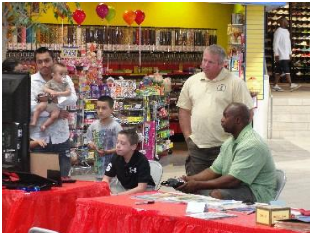
Visitors enjoying the Flight Simulators Software