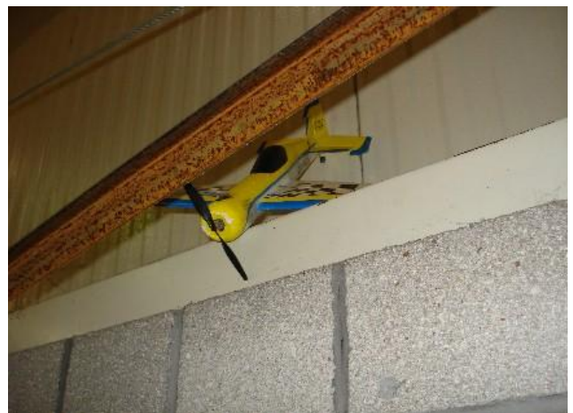
Landing his plane way up the wall behind some beams was Butch Spradling