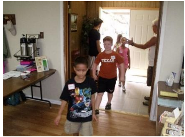
Coming in for the Day