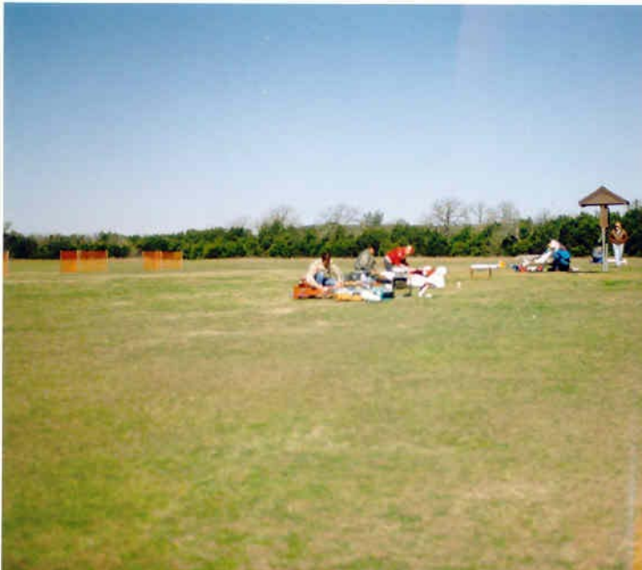
A DAY AT THE FIELD